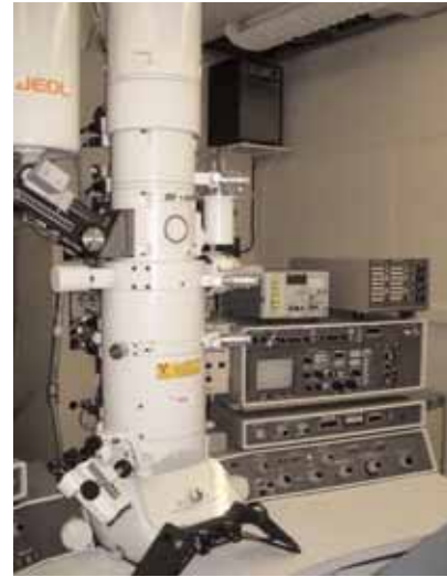
Jeol Electron Microscope

1/4 Scale Blast Furnace Simulator, with Spare Bell.