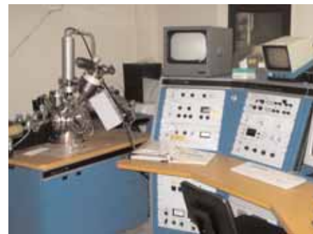
Physical Electronic Surface Spectrometer - Assorted Microscopes