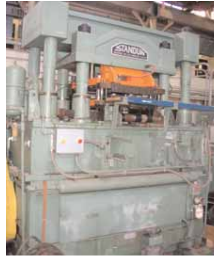
Can Equipment: Standun Cupping Press & Redicon Can Beadier