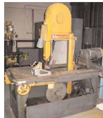
Marvel Band Saw