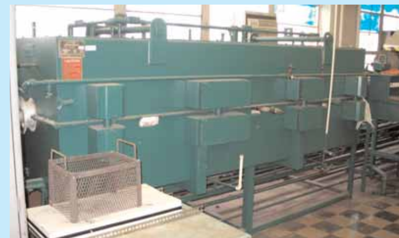
Below: Over (20) Lindberg Hevi-Duty and other Furnaces.