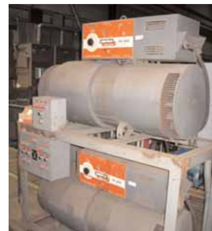
Lincoln SA-800 Welders