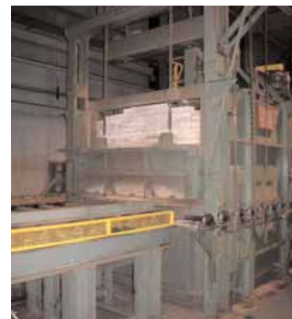
Drever Pre-Heat Furnace and other Furnaces