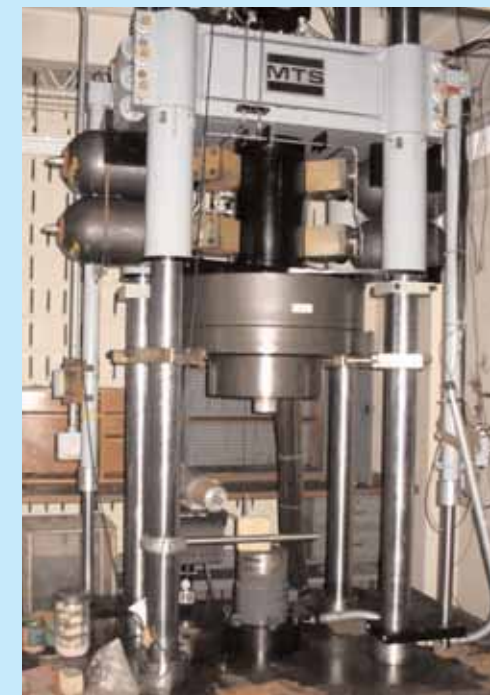
Left: (8) MTS and Baldwin Tensiel Testers.