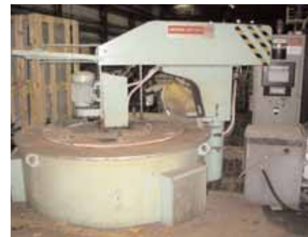
Lindberg Hevi-Duty Furnace