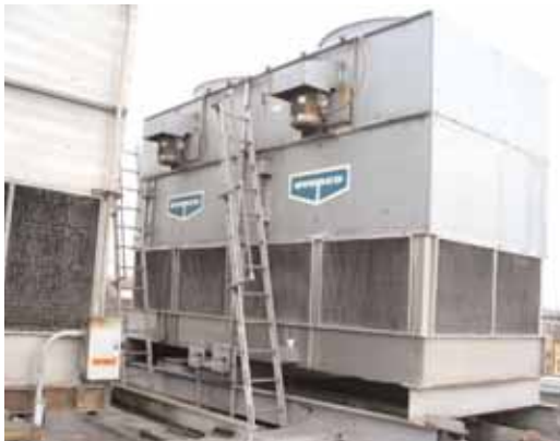
1994 Evapco Cooling Tower