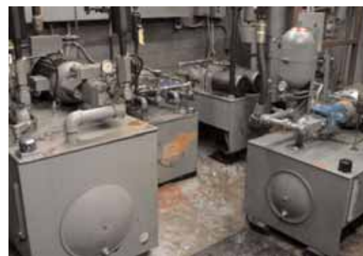
Hydraulic Pump Systems