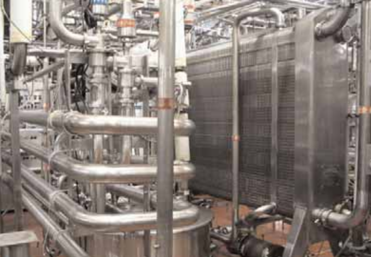
(2) APV 7,500 gph HTST Systems - (1) Replated in 2004!

TERMS: A 10% BUYER'S PREMIUM APPLIES TO ALL SALES. Full payment day of sale in guaranteed or certified U.S FUNDS. Company check accepted with letter of approval from your bank. Direct wire transfers to the account of Harry Davis & Company accepted ONLY with prior arrangement. You are urged to inspect before the sale. Removal of items by designated insured riggers only. Although information has been obtained from reliable sources, the Auctioneer makes no warranty or guarantee, express or implied as to the the accuracy of information in this brochure. Additional terms to be announced at the auction sale.