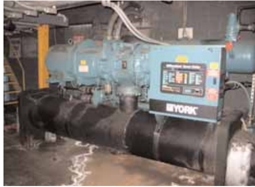
York 175 hp Screw Chiller