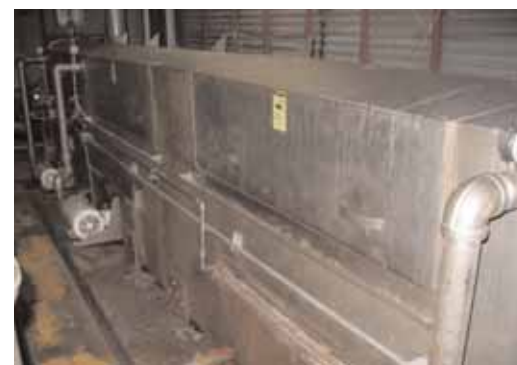
(2) Continental Case Washers