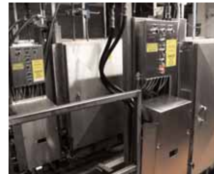
Dairy Conveyor Case Stackers - Rear View: Evergreen N8 Filler