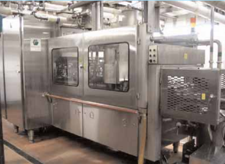
(8) Filling Lines - Evergreen N8 pictured above

WHO: SUNNYDALE FARMS WHAT: A Harry Davis & Co. Auction Sale of Fluid Processing & Blow Molding equipment and 84-Unit Trailer/Truck Fleet. WHEN: TUESDAY, APRIL 5, 2005 at 9:30 a.m. WHERE: 400 Stanley Ave., Brooklyn, NY 11207 DIRECTIONS: From LaGuardia Airport, 94th St. to Grand Central Parkway towards Long Island, 5 miles to exit 13 Jackie Robinson Pky towards Brooklyn, 5 miles, bear left at Granville Payne Ave, 1.6 miles to right at Stanley Ave. 0.2 miles to sale site. Watch for Auction Arrows!