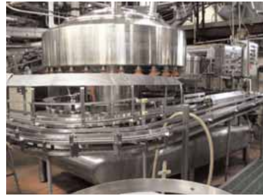
Federal 30-Valve Filler

Foss Milko Scan 104, ABBE Digital Refractometer, Quebec Colony Counter, Dairy Lab 2, Garver Centrifuge, Nova Microscope, Refrigerator, Incubator, Glassware and Lab Supplies.