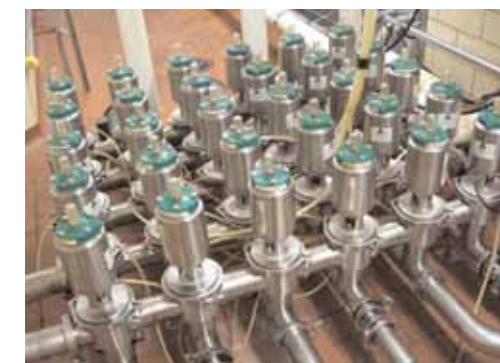
(30) Tri-Clover S/S Air Valves