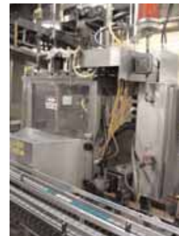
Haab Slant Caser & Pak-Tek Caser