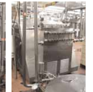
APV 7,500 gph HTST Manton Gaulin MC75 and MC100 Homogenizers