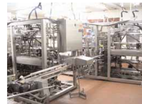
(2) Cannon Bossie Loaders