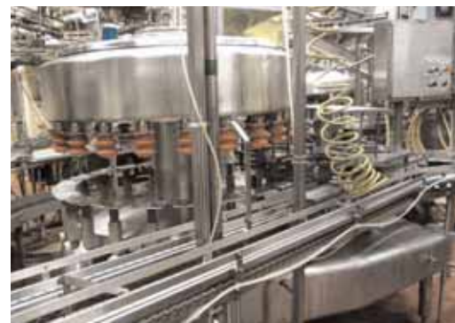
Federal 21-Valve Filler