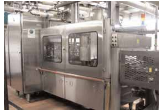
Evergreen N8 Filling Line