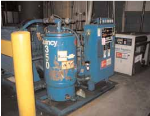
(6) Quincy Screw Air Compressors up to 125 hp