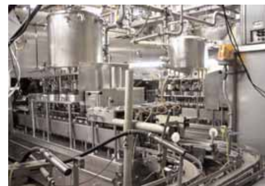
Cherry Burrell CH5 and H90