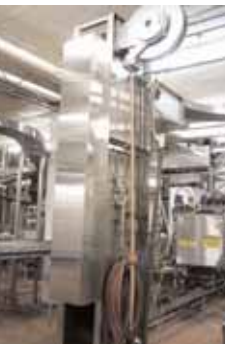
S/S Case Conveyor