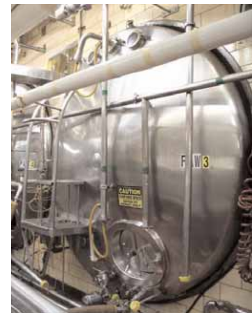
(19) S/S Silos & Tanks

Pictured: 6,000 Gal. Tanks with S/S Fronts