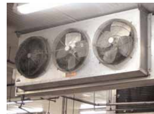
(18) Kramer and Niagara Cooler Blowers

Pictured: 6,000 Gal. Tanks with S/S Fronts