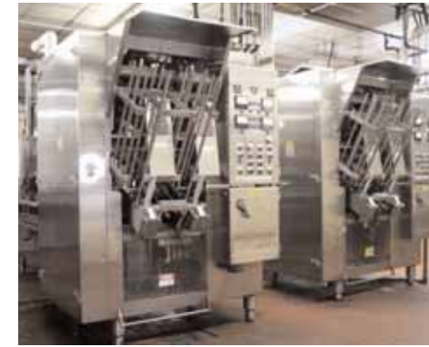
(2) Evergreen Q11 Filling Lines