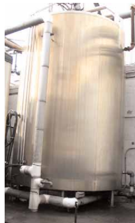
(7) Walker & Mueller 50,000 S/S Silos (2) Walker 5,000 Gal. All S/S Juice Concentrate Tanks