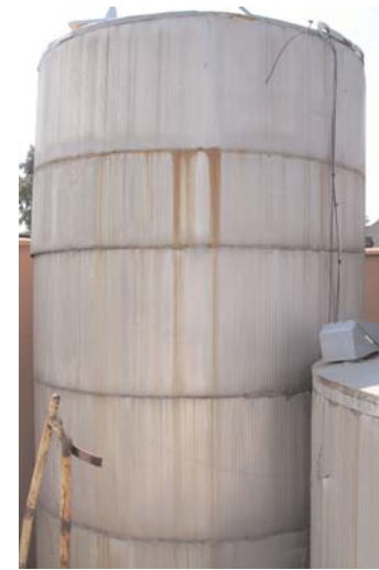
Mueller 5,000 Gal. Silo - (2) 6,000 Gal. Sugar Tanks