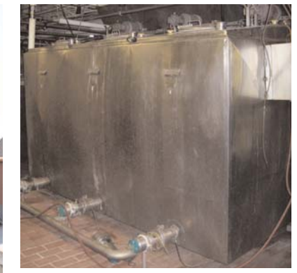
Above: (2) Mix Tanks Right: APV 50 Gal. Jacketed Blender; Switch Gear