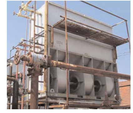
Left: (3) BAC Evaporative Condensers Below: RVS Shell & Tube Ammonia Chiller