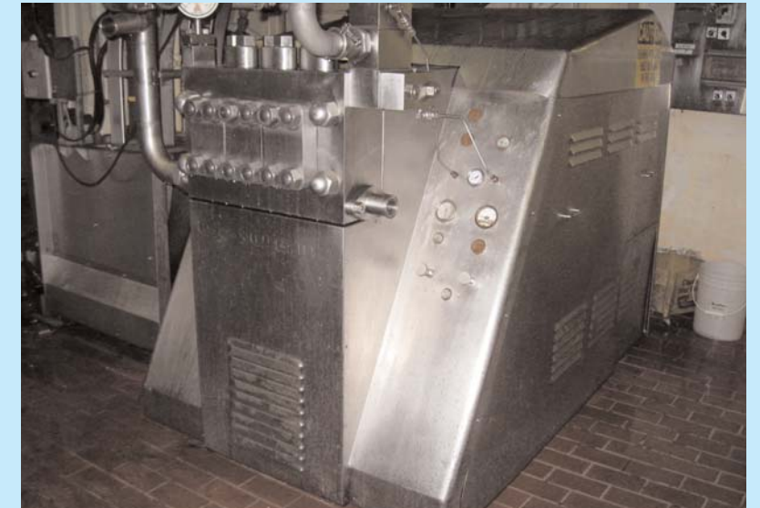
Gaulin MC45-3TPS Homogenizer with HVA