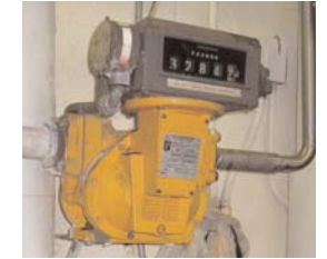
Left: Blending System with Meters & Controls Right: Chester Jensen Model B-20 Glycol Chiller; (8) Ammonia Blowers