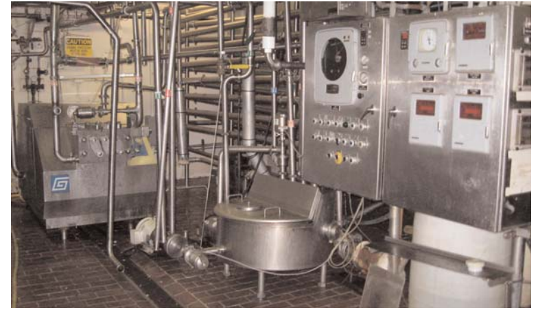
APV 4,000 gph Mix HTST System & Gaulin MS18 Homogenizer

(9) Tri-Clover 3" S/S Air Valves in Manifold, (2) Mag Flow Meters, 100's of feet 3" and 2" S/S Pipe, Flowverter Stations, (3) Tri-Clover Pumps, Clamps, Elbows and More.