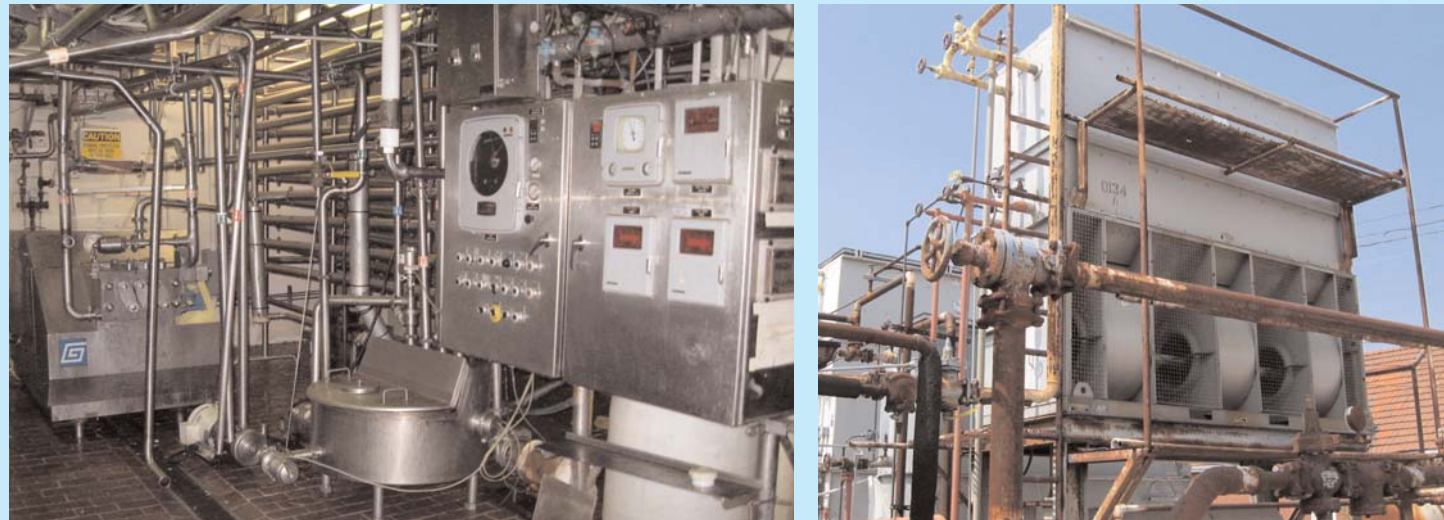
APV 4,000 gph Mix HTST System & Gaulin MS18 Homogenizer - (3) BAC Evaporative Condensers

SOUTHERN PRODUCTS, INC. - St. Louis, MO Thursday, October 11 at 9:30 a.m.