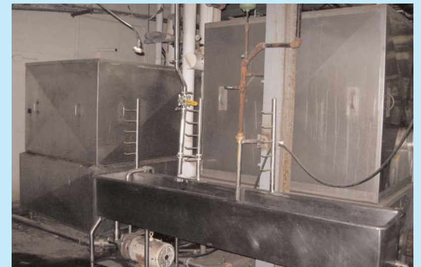
Chester Jensen B-20-T & Mueller S/S Glycol Chillers