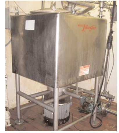
(2) Breddo 200 & 100 Gal. Likwifiers - Liquibox Bag-In-Box 2-Station Filler