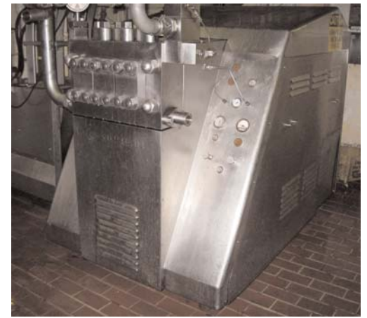
Gaulin MC45-3TPS Homogenizer