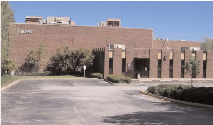
Former DiGIORNO FOODS Facility Riverchase Business Park - Hoover, Alabama

Production/Warehouse Space - Refrigerated Storage - Offices Riverchase Business Park - Hoover (Birmingham), Alabama 35244 REAL ESTATE AUCTION: Thursday, September 14, 2006 at Noon