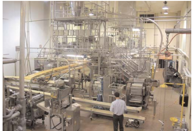
LIGHT MANUFACTURING/WAREHOUSE FACILITY - 2072 Valleydale Rd., Riverchase Business Park