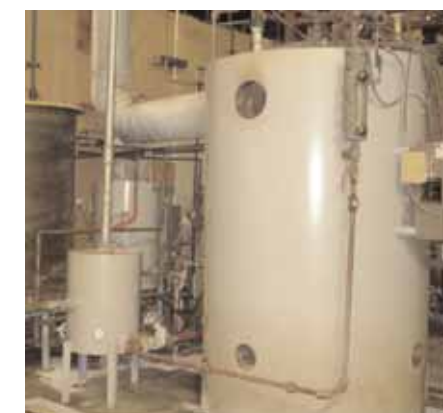
Fulton 50 hp Vertical Boiler System