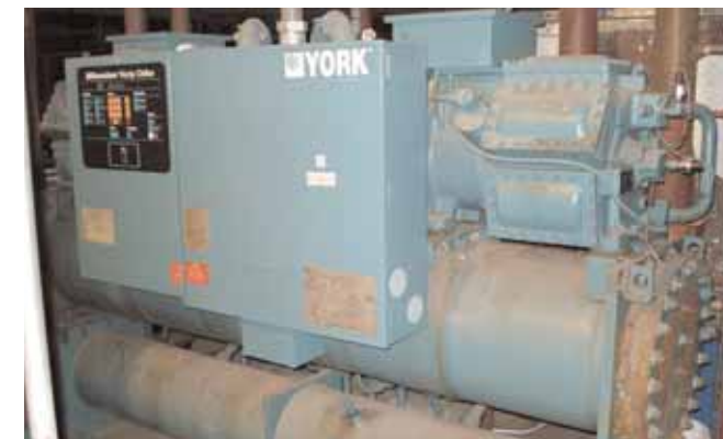
York Packaged Chiller and BAC Perma Cold Evaporative Condenser