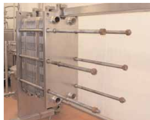
APV Model SR35-S S/S Plate Press