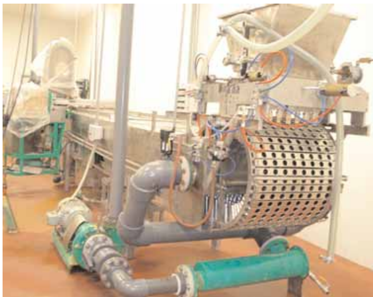
(3) 8-Wide Vitaline Stick Novelty Lines

Rainbow Glacier - Vancouver, WA Thursday, February 21, 2008 at 9:30 a.m.