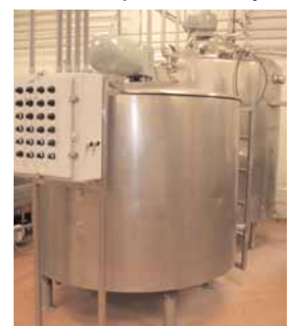
(6) S/S Mix Tanks to 1,000 Gal.