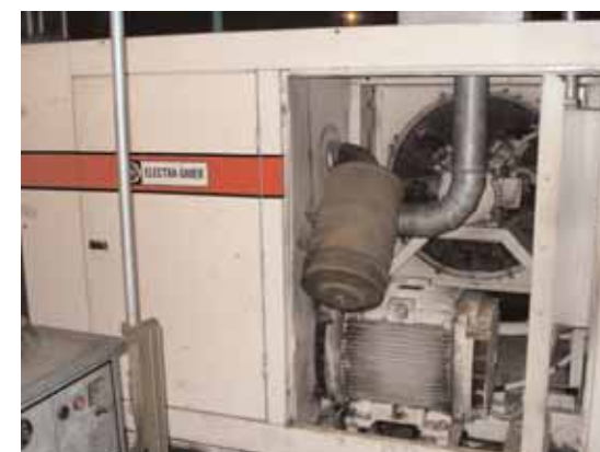
Gardner Denver 100 hp Screw Air Compressor