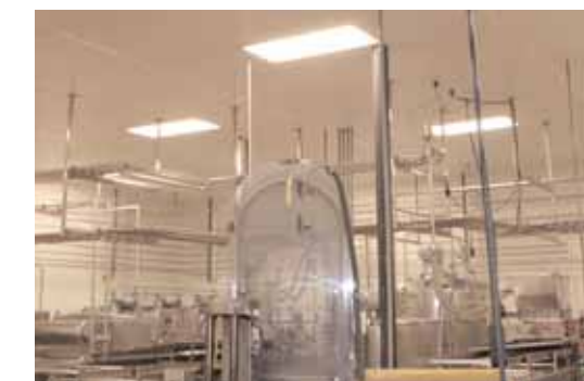
Modular Building & Process Line Overview

ONLINE BIDDING AVAILABLE AT www.harrydavis.com