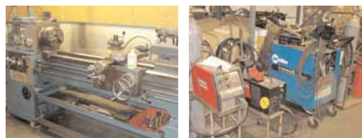
Lathe, Welders and other Shop Equipment

Maintenance Shop Equipment Including: K 6 ft. Lathe with 3-Jaw Chuck; Miller Syncrowave 250 CC AC/DC Mig Welder; Linclon Model SP170T Wire Feed Welder; Hypertherm Max 43 Plasma Cutter; Assortment of Welding Wire; Burning Cart with Gauges; Machinery Movers; Welding Table with Mounted Vise; Assorted Fiberglass Ladders; Portable Chop Saw; Ridgid 400 Pipe Threader; Ridgid Sewer Cleaner; Central 2-Ton Portable Crane; Double End Grinders; Hydraulic Press; Delta Drill Press Cat #17-900; Purewash Parts Washer; Nut & Bolt Supply; Hand Tools Including Milwaukee Portable Band Saw, Milwaukee Portable Hammer Drill, Porta-Cable Circular Saw & More