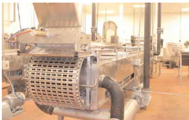
Hayes Stick Novelty Boxer - (4) 8-Wide & 6-Wide Vitaline Stick Novelty Systems