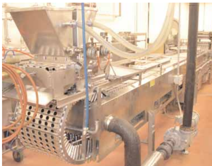
6-Wide Vitaline Stick Novelty Line