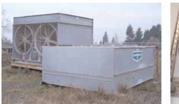
(2) Evapco Evaporative Condensers