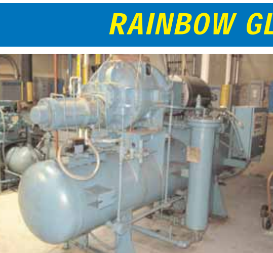
Frick 100 hp Screw Ammonia Compressor