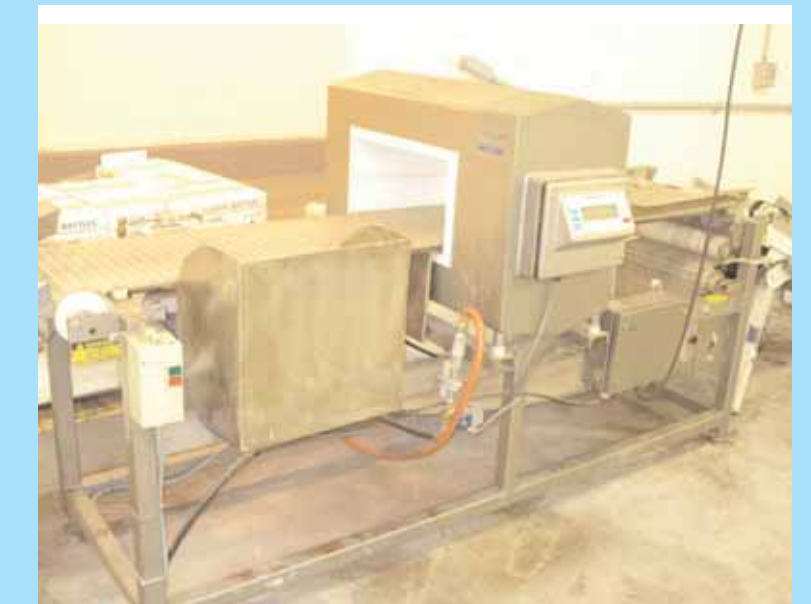
Goring Kerr Metal Detection System