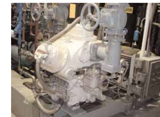
Mycom 40 hp Refrigeration Compressor