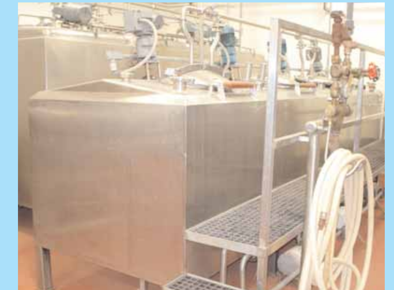
(3) 4-Compartment & 2-Compartment Flavor Tanks

ONLINE BIDDING will be available through Bidspotter. See terms and details at www.harrydavis.com