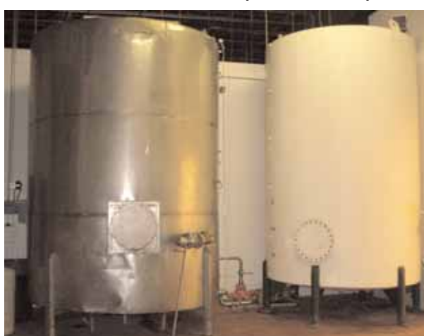
(2) Aprox. 5,000 Gal. Sugar Tanks with UV Systems

Park Int. Water Ionizer, Type RT-2471-4 Water Softener System, with Spare Unit