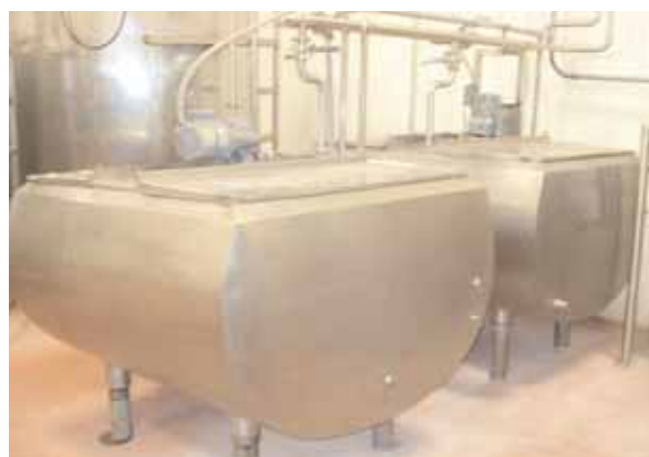
(2) Valco 300 Gal. All S/S Farm Tanks