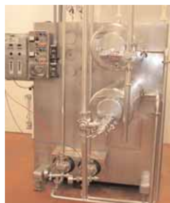
C.B. V-603 Ice Cream Freezer