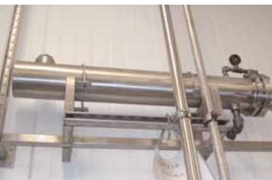
Shell & Tube Heat Exchanger