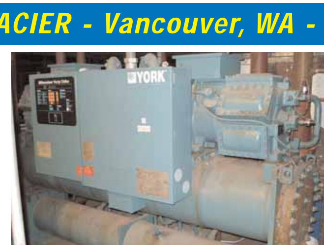
York Packaged Chiller and BAC Perma Cold Evaporative Condenser