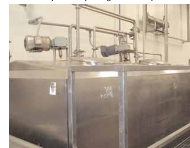
(3) 4-Compartment & 2-Compartment Flavor Tanks