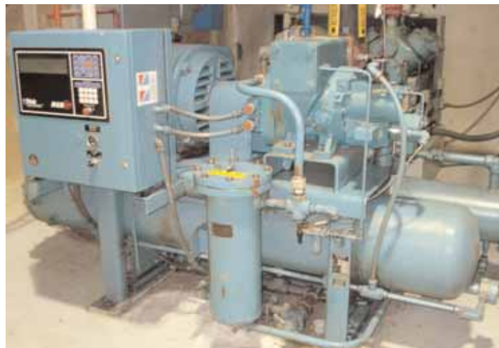
(2) Frick 125 hp Models RXF50 and RXB50 Screw Ammonia Compressors

Additional Items: 75" L Portable Jet Spray Wash Trough, with APV Pump with New Style Head; 4 ft. L All S/S Shell & Tube Heat Exchanger (Recent Addition); (4) Pacemaker S/S Baggers; S/S Tables; S/S Sinks; (2) Strahman M-5000 Hose Mixing Stations; (2) Schilumberger Liquid Sugar Meters