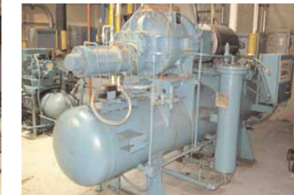
Frick 100 hp Screw Ammonia Compressor