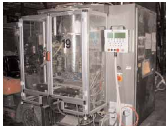
1997 Sasib/Ricciarelli Form, Fill and Seal Line with 14-Head Rotary Scale (St. Louis)