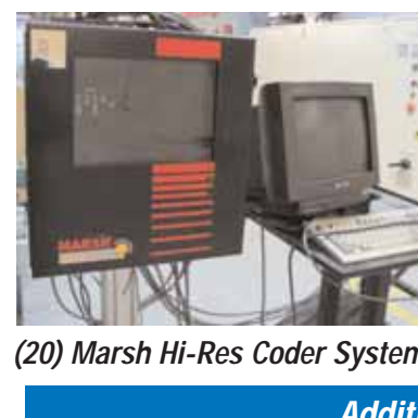
(20) Marsh Hi-Res Coder System