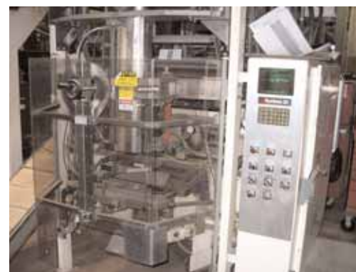
Triangle Selectacom SPD Volumetric Scale Filler & Bagging System