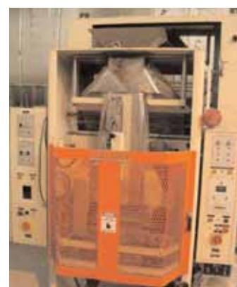
Stavelli Form, Fill, Seal Bagger