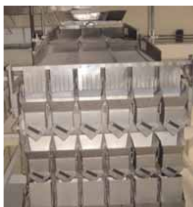
FMC Vibrating Conveyor