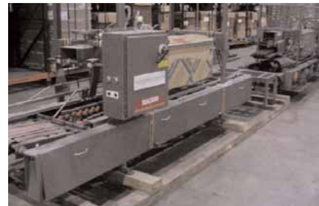
(3) NEW Rockford Midland Case Sealers