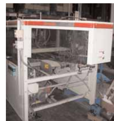
(2) Bemis Bag-In-Box Lines