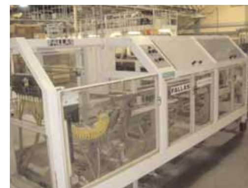
Assorted Fallas Case Packers