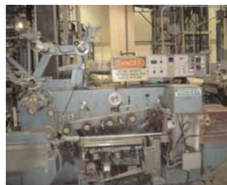
Ricciarelli Horiz. Form, Fill & Seal Line