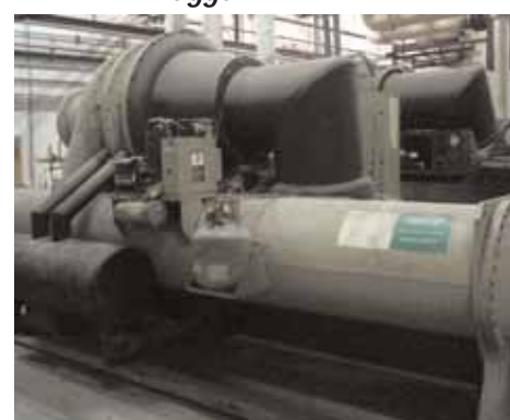
Trane 150-Ton Water Chiller