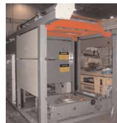
1995 Alvey 880 Palletizer