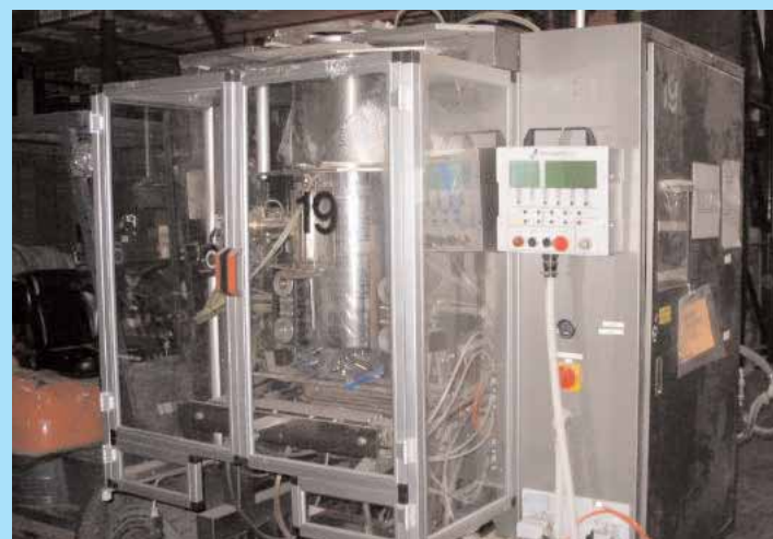
1997 Sasib/Ricciarelli Packaging Line - Triangle Selectacom Volumetric Scale Filler & Bagging System - MORE!!

Surplus to NEW WORLD PASTA - St. Louis, Missouri AUCTION: THURSDAY, MARCH 17 at 9:30 a.m.