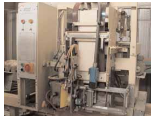
(8) Ricciarelli G3 Packaging Scales