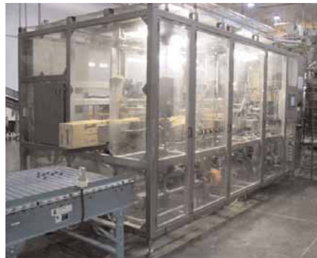
Late Model Rockford Model 808HM Case Packer

Late Model Rockford Case Packer, Model 808HM, S/N 11189, Complete with Xycom PLC Controller, Packed (12) 16 oz. Short Goods Pasta Product, Skidded and Ready to Load (St. Louis) (2) Schroeder Quadnumatic Case Packers, Model 1000, S/N 5541, Allen Bradley SLC 150 PLC (St. Louis)