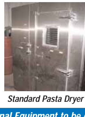
Standard Pasta Dryer