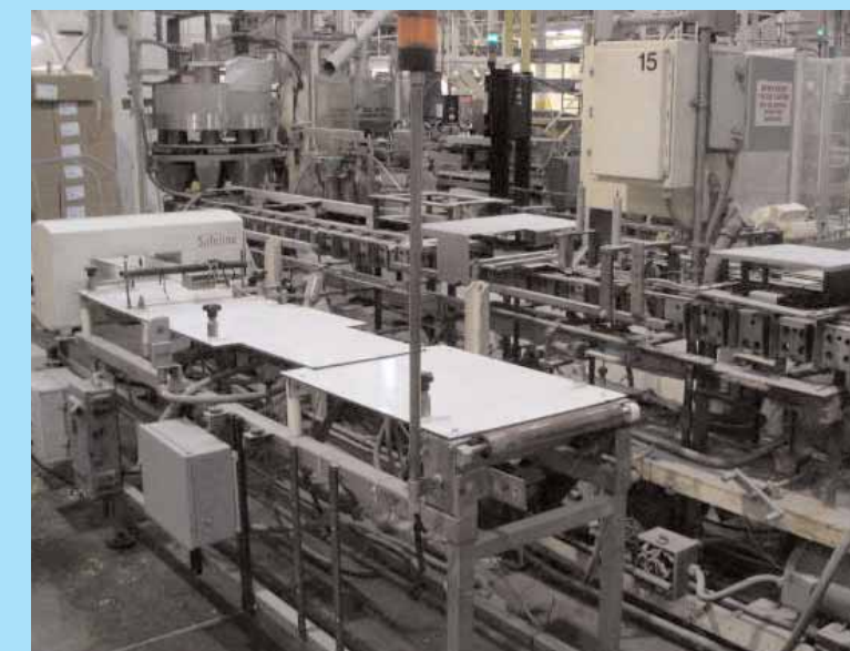
Mac-N-Cheese Line with Clybourne Packer (St. Louis)