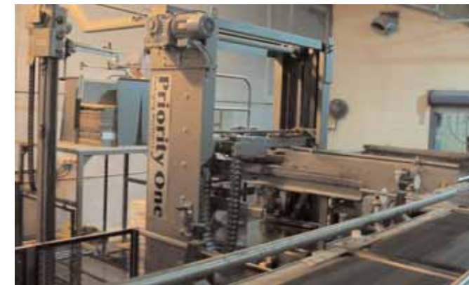
(2) 1998 Priority One Palletizers