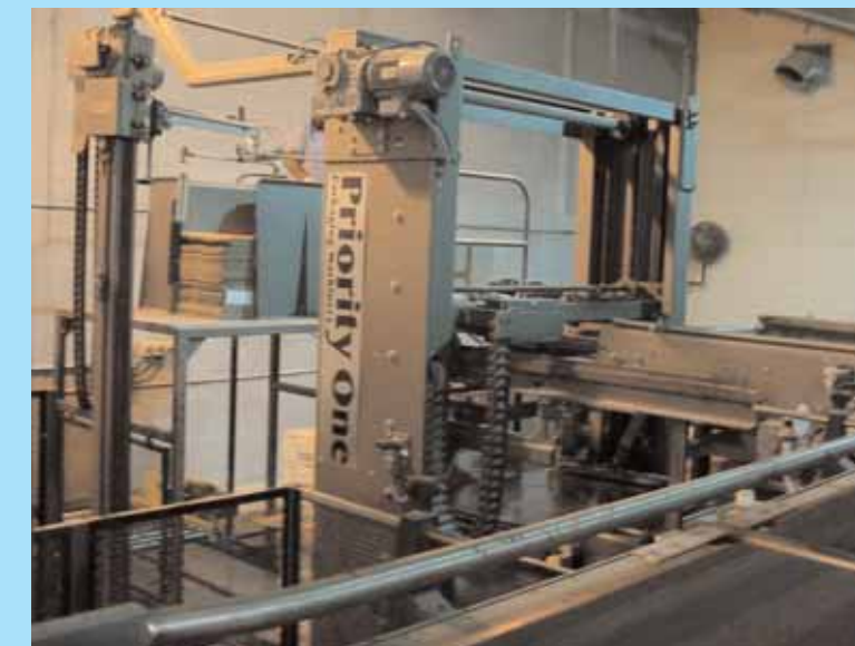
(2) 1998 Priority One Palletizers (Omaha, Neb.)

ONLINE BIDDING will be available through Bidspotter. See terms and details at www.harrydavis.com .