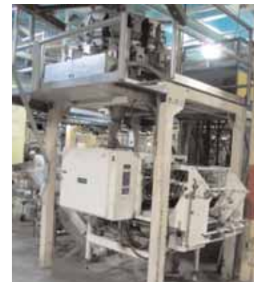
Hayssen Ultima Vertical Packager w/Yamoto 8-Head Scale