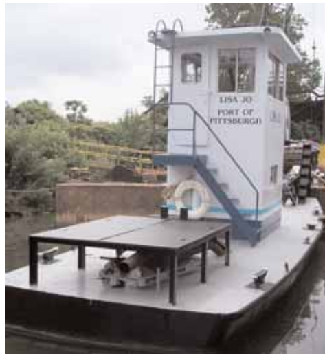
"Lisa Jo" 318hp Towboat (Truckable)