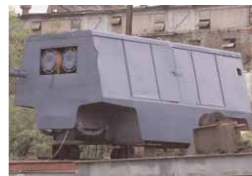
Far Left: Assortment of Diving Gear