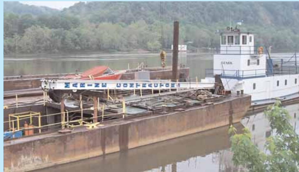
Vulcan 2800 Vibratory Pile Hammer - "Ozark" 400 hp Towboat - Spud Barge w/200-Ton 50' A-Frame

HARRY DAVIS & CO. - www.harrydavis.com - (800) 775-2289