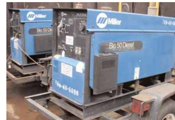
(2) Miller "Big 50" Diesel Welders