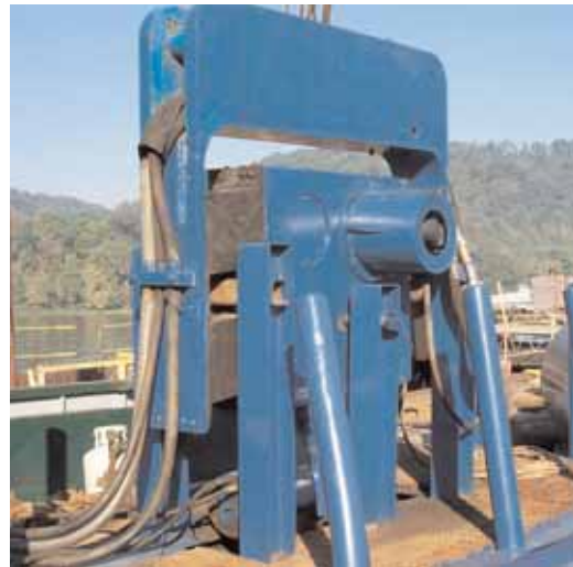
Vulcan 2800 Vibratory Pile Hammer

Motor Vessel "Lisa Jo" 318 hp Towboat , 35 ft. x 12 ft. x 6 ft., Truckable, GM 8V-71 w/3.5:1 Allison Marine Gear. Engine and gear placed in 2000 [1900 total hours]. New Navigation Lights, Fire Alarm System, New Marine Radios, Class III Sanitation System - All Installed in 2006! Hydraulic Steering. Hull blasted & painted in 2006.