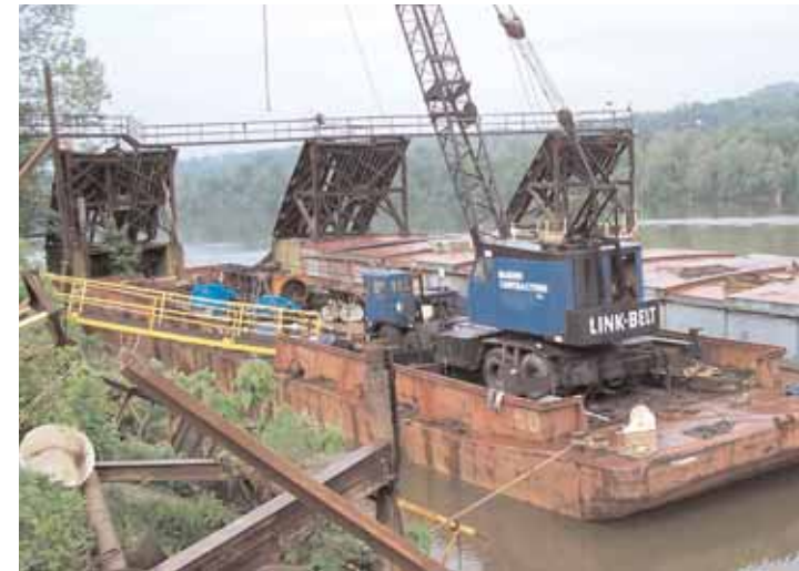
View of Spud Barge & Covered Barge, Link Belt Truck Crane