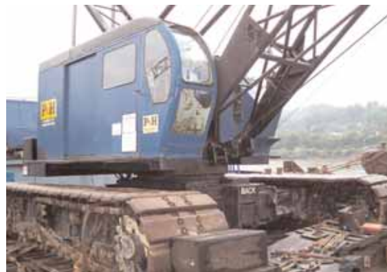
P & H 70-Ton Crawler Crane (presently mounted on Barge) - Link Belt 50-Ton Truck Crane

(4) 2-Cubic Yard Clam Buckets, all need some repair. 2 Cubic Yard General Purpose Clam Bucket. 1 Cubic Yard Concrete Bucket.