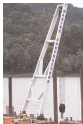
200-Ton 50' A-Frame (Built 2004) - Assorted Buckets

One complete Hard Hat Diving Station , Ultra Lite Hard Hat, gasoline powered air compressor, surge tank, standby high Pressure air tank with regulators, underwater burning/ welding equipment, knife switch, 6 ft. x 8 ft. utility trailer, 200 ft dive hose bundle, new communications equipment 2005.