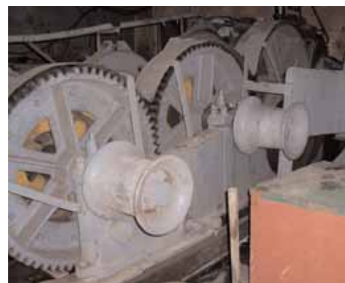
3-Drum Winch on Spud Barge - View of Covered Cargo Barge