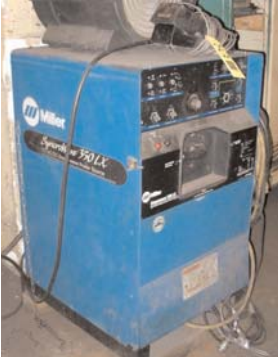
Assortment of Welders

318 Donohoe Rd. - Latrobe, PA 15650 (Rt. 30 to Lewis Rd. to Donohoe Rd.)