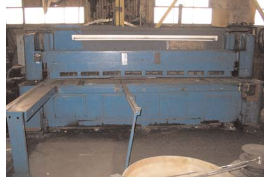
Niagara 1/2" x 10' Model 1010 Shear