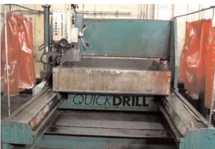
Quick Drill CNC Drilling Center - Ooya & other Radial Drills

(22) Miller, Lincoln, ESAB, Ltec and Hobart Mig, Tig, Idealarc, Pro-Cut, Syncrowave and Other Welders, Plasma Cutters and Wire Feeders.