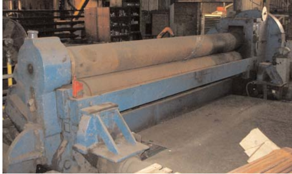
Bertich 5/8" x 14' Bending Roll Set