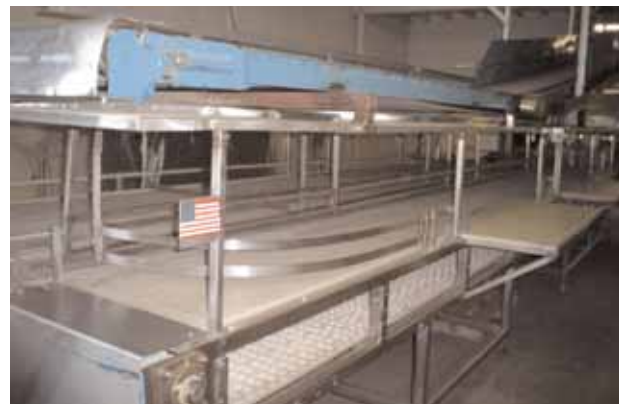
Assorted Accumulation & Sorting Tables