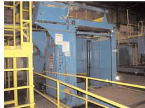
(3) Palletizers and Depalletizers