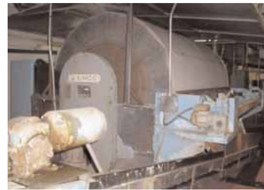
Emco Rotary Vacuum Filter