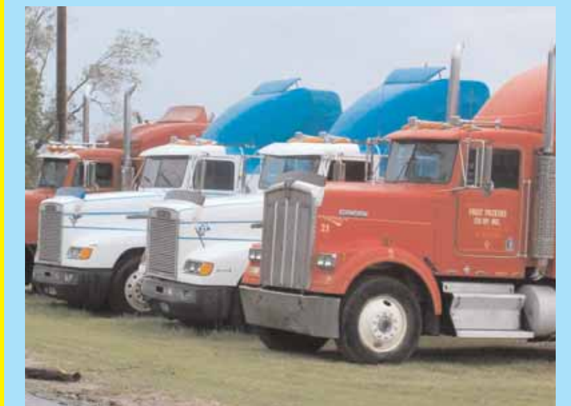
(11) Peterbilt, Kenworth, Volvo & other Tractors