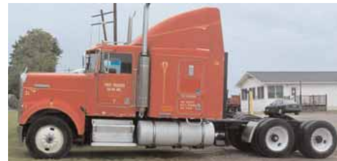
1982 International Tractor with Cummings Engine, VIN 1HTDF2574CHA22497, Model F-2575.