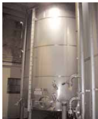
(2) Feldmeier 12k Gal. Tanks