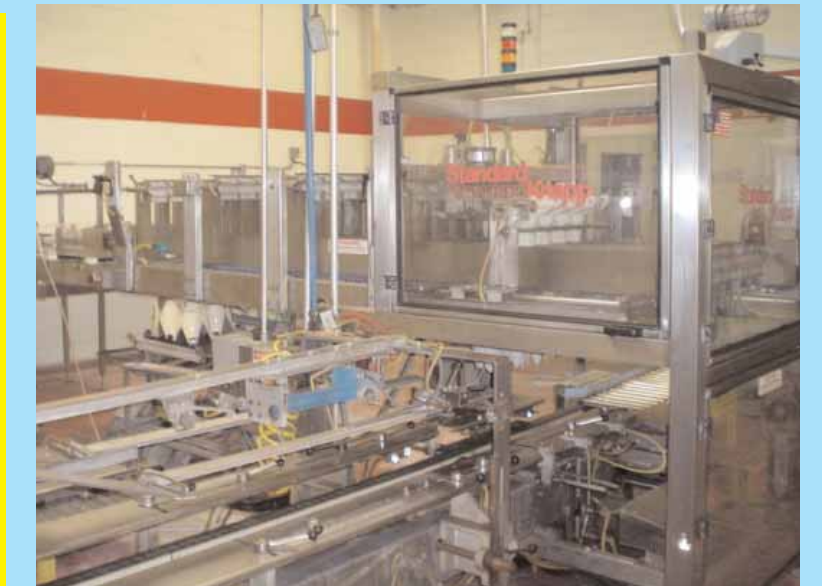
1996 Standard Knapp Type 939 S/S Case Packer