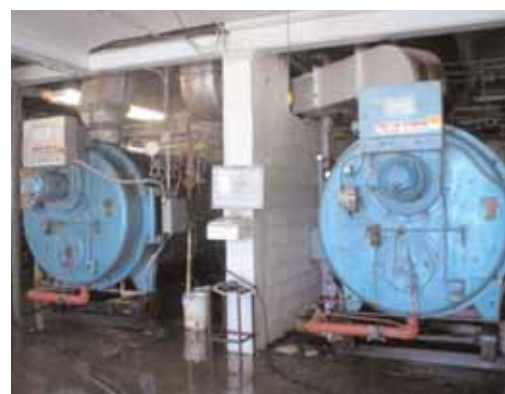
(2) Cleaver Brooks Boilers