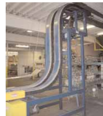
Mid States Lowerator