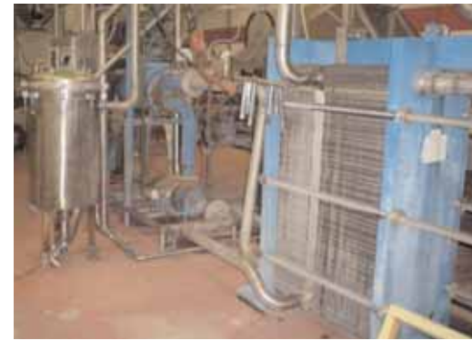
APV Juice Pasteurizer and other Heat Exchangers