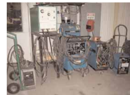
General Plant/Maintenance Equip.