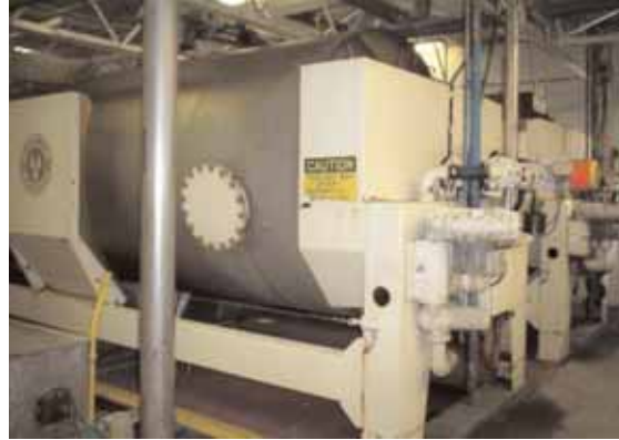
(4) Wilmes Model TP14 Juice Presses

ADDITIONAL JUICE EQUIPMENT: Rice Hull Hopper and Baler, Bra Con Baler, Model 800, S/N 8122-S2.SDS for 5' x 3' Bales, Bucher 14" S/S Grinder, Model 6A wit 30 hp Motor and Hopper System; Juice Receiving and Accumulation System with Maselli Flow Meter and Air Valves.