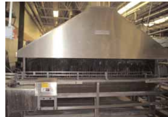
(2) 1995 Standard Cooling Tunnels