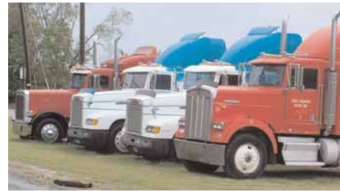
1994 Peterbilt Tractor, Model 379, w/Detroit 400 Diesel Engine, 9-Speed Transmission, VIN: 1XP5DR8XXRD344908.