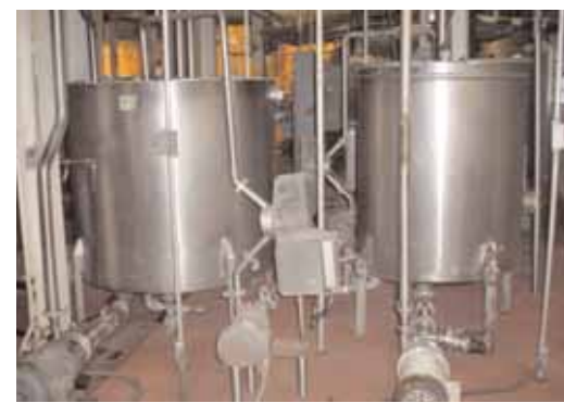
Assorted S/S Tanks up to 12,000 Gal.

S/S TANKS (2) 1996 Feldmeier 12,000 Gal. S/S Cone-Bottom Tanks. (3) 12,000 Gal. S/S Tanks. 6,000 Gal. S/S Tank with Agitator. Feldmeier 1,800 Gal. S/S Tank with Agitator. 1,000 Gal. S/S Jacketed Tank (3) APV 500 Gal. S/S Tanks with Agitator. Additional Small S/S Tanks with Agitators and Pumps. FIBERGLASS & POLY TANKS (5) Resin Fab 12,000 Gal. Fiberglass Tanks, (2) with Agitators. 12,000 Gal. Cone-Bottom Fiberglass Tank. (3) 2,000 Gal. Fiberglass Cone-Bottom Tanks. 2,900 Gal. Fiberglass Dome-Top Tank (2) 1,800 Gal. Poly Tanks. (2) 1,200 Gal. Fiberglass Open Top Cone Bottom Tanks.