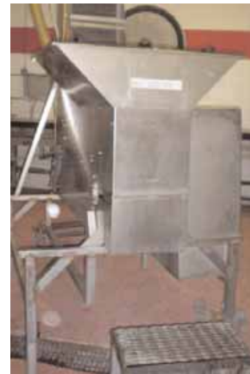
Above: 1996 U.S. Bottlers 8-Head Capper and 1996 U.S. Bottlers Cap Feeder; Left: 1997 Cap Sterilizer