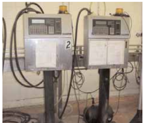
(3) VideoJet Coders