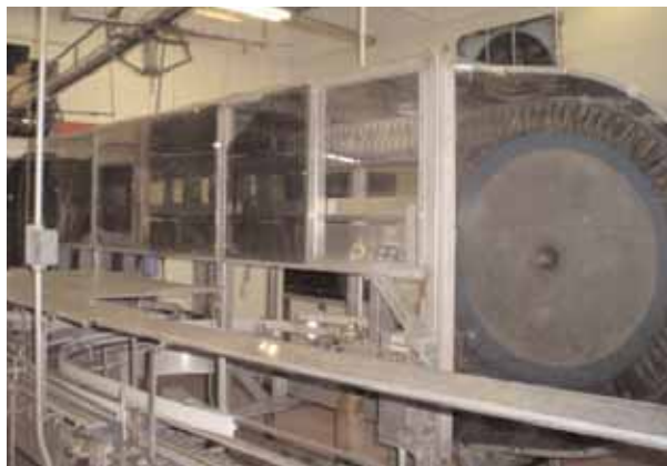
Seco Grip Invert Bottle Washer