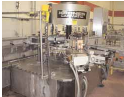
1996 Krones Canmatic Labeler