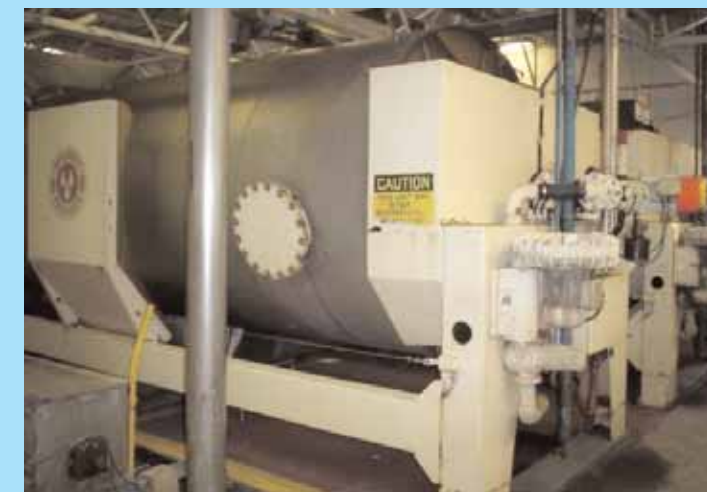
BINER ELLISON 48-VALVE FILLER - (4) WILMES MODEL TP14 JUICE PRESS SYSTEMS - MUCH MORE!

HARRY DAVIS & CO. - www.harrydavis.com - (800) 775-2289