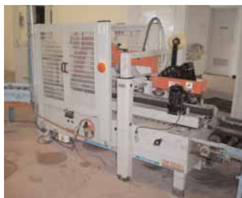
3M & other Case Sealers