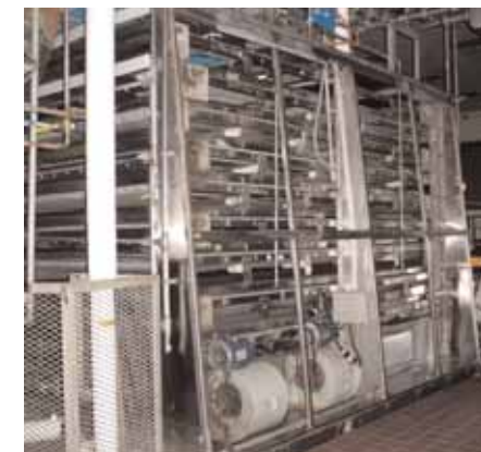
Alimac S/S Short Goods Pre-Dryer