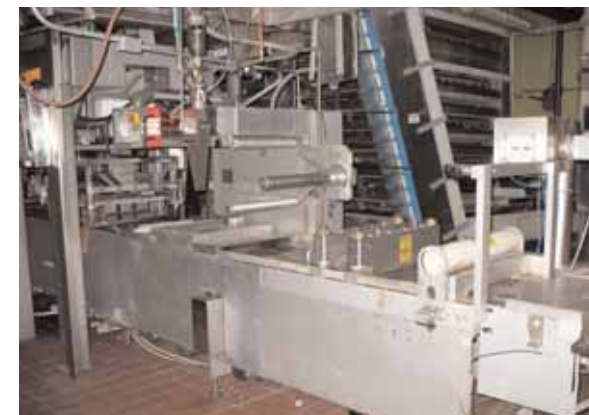
(4) Multivac R5200 Vacuum Packagers with Updates