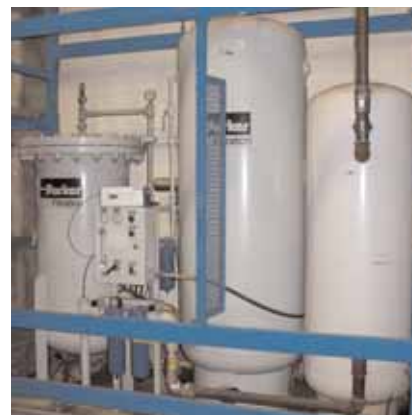
Parker Nitrogen Generator