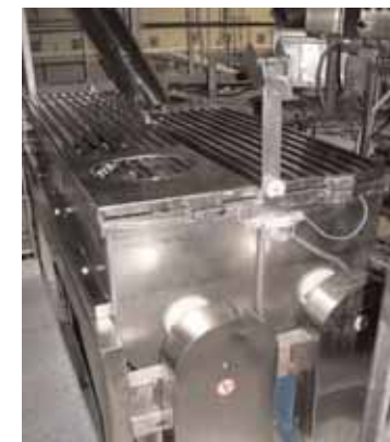
(4) S/S Grim Mixers