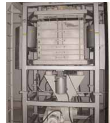
2002 Great Western Flour Sifter