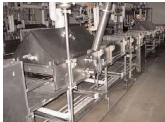
(6) Toresani S/S Pasteurizing Tunnels