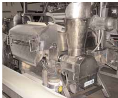
2003 Pavan/Toresani Model MRP540 Former