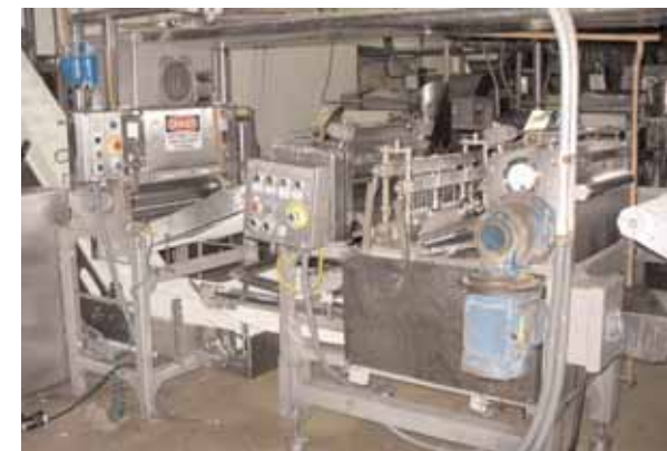
Toresani Model MRP550 Ravioli Line