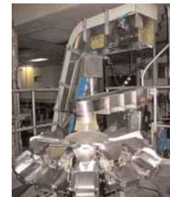
(2) Ishida 14-Bucket Scale Fillers