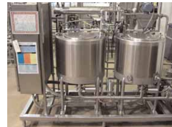
2001 Skid Mounted CIP System