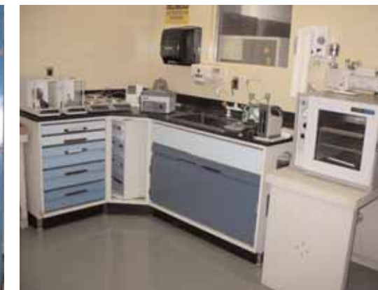
Excellent Selection of Lab Equipment & Fixtures