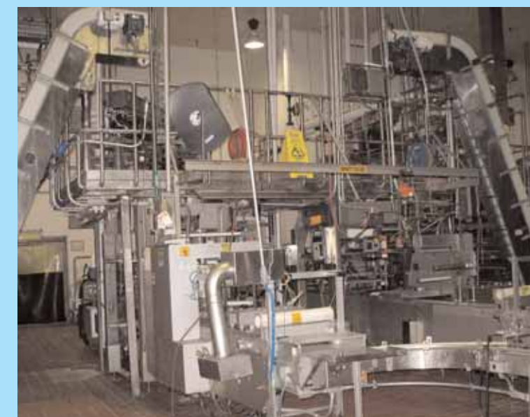
(2) Multivac Vacuum Packagers - (2) Ishida 14-Head Scale Fillers - Inclined Conveyor Systems