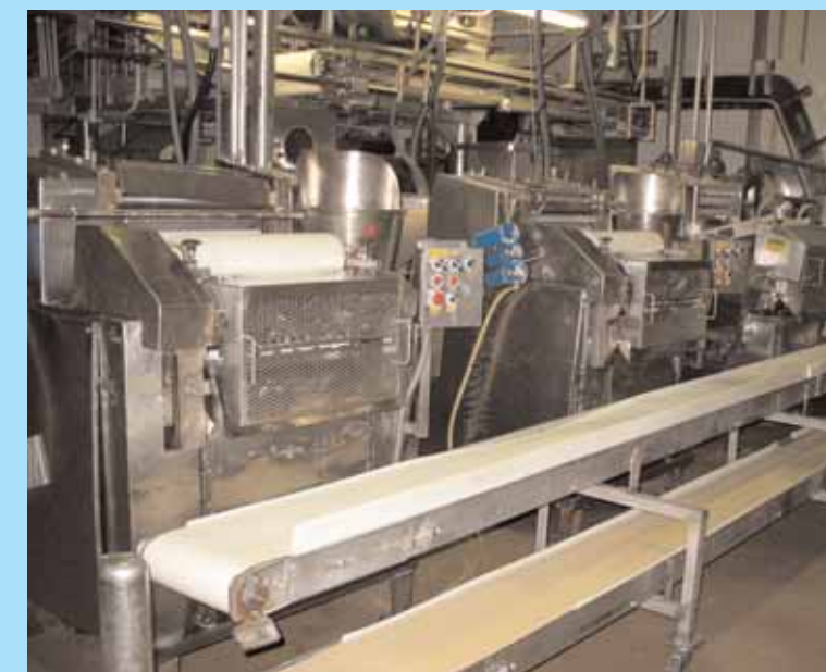
(12) Pavan Toresani Kneader-Sheeters & Formers - See Inside!

ONLINE BIDDING will be available through Bidspotter. See terms and details at www.harrydavis.com