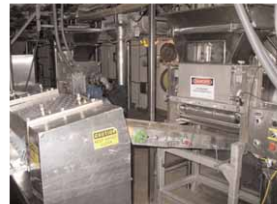
(4) Toresani Long Goods Kneaders & Calibrating Rolls