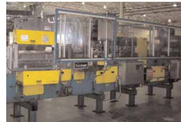
Mead Duodozen Model 1225 Case Packer