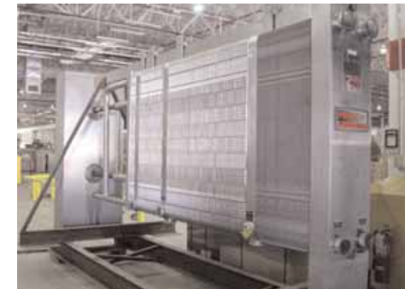
APV Model R51TH Mix HTST Press