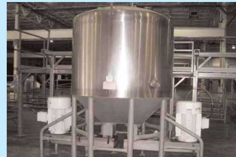
Breddo 1,000 Gal. S/S Dome-Top Cone Bottom Likwifier