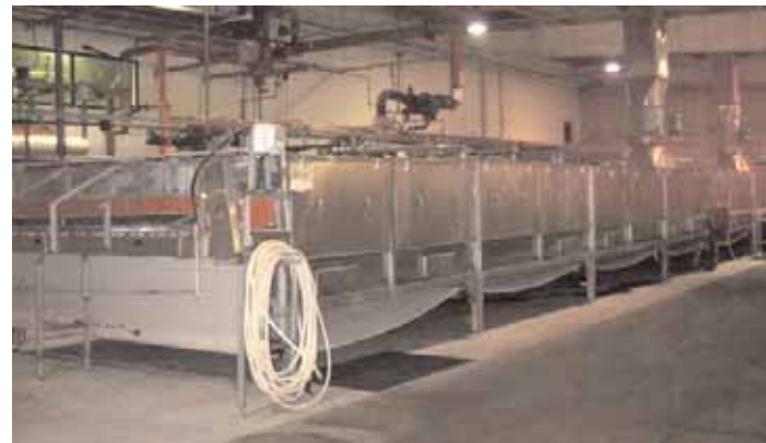
Aeroglide S/S Pasteurizing and Cooling Tunnel