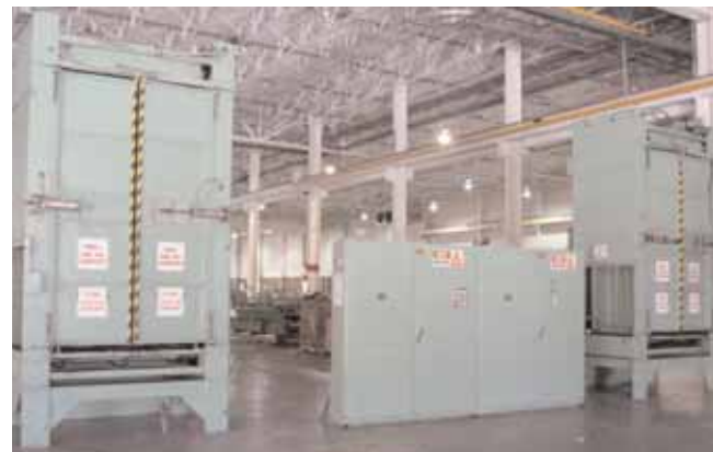
(2) Tri-Can Depalletizers