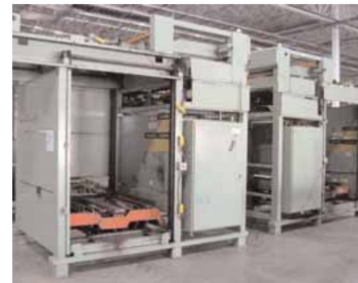
(2) Alvey Model 800 Palletizers