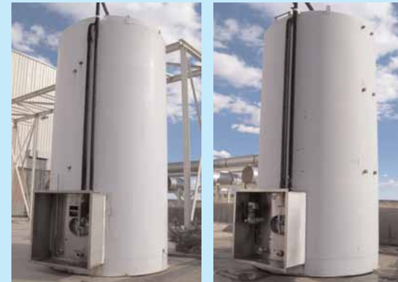
(2) Mueller 10,000 Gal. S/S Silos