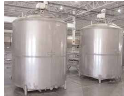
(3) Mueller 2,000 Gal. Dome-Top Mix Tanks