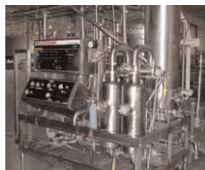
Mojonnier Carbo Cooler