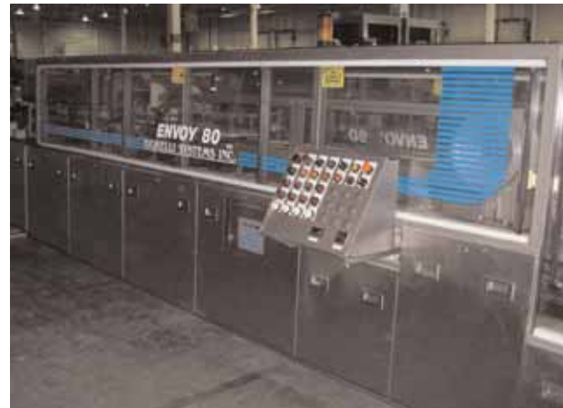
Nigrelli Envoy 80 Case Packer