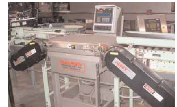
Ramsey Icore 4000 Auto Check Weigher