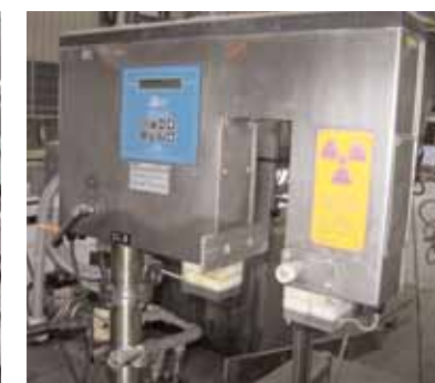
Filtec Level Detector