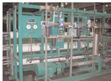
(2) Culligan Reverse Osmosis Systems