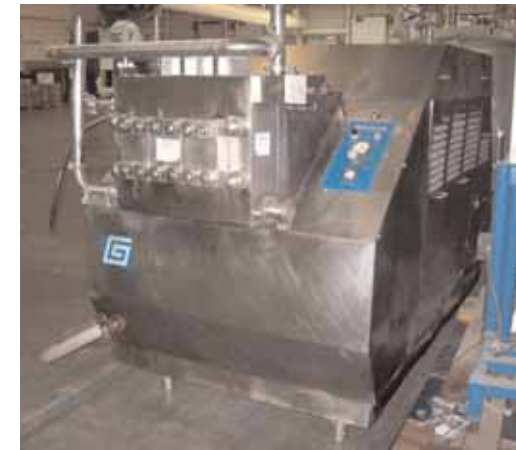
APV Gaulin MS45 Homogenizer