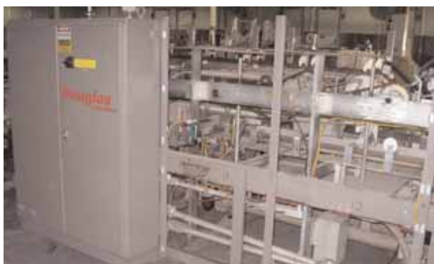
Douglas Tray Former