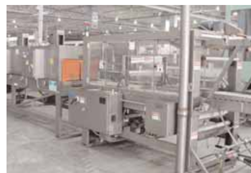
Arpac Shrink Wrapper & Tunnel