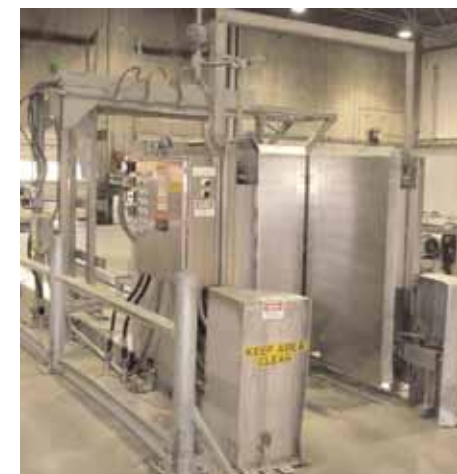
Cannon S/S Depalletizer