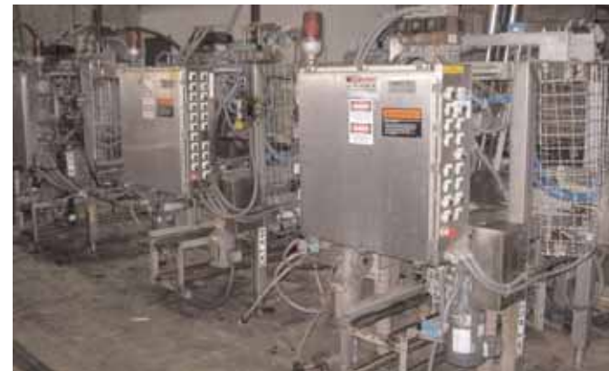
(6) Cannon Hydraulic Casers