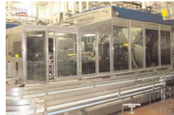
Tetra Pak Rex Model TR-8-ESL Carton Filler