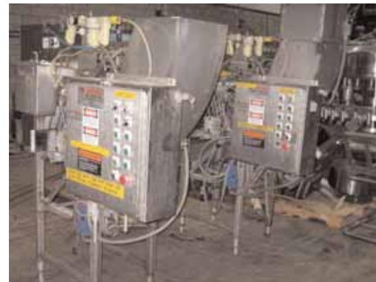
(2) Cannon Slant Rotary Casers