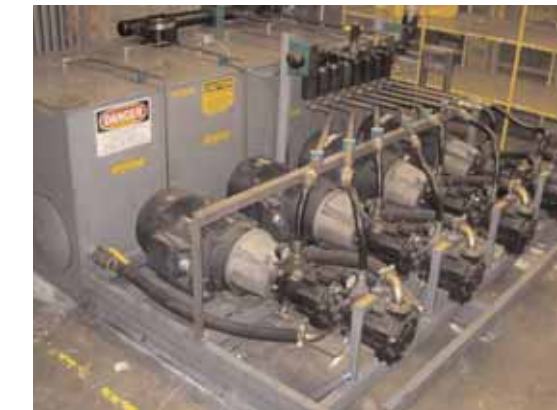
Hydraulic System with (4) 50 hp Pumps