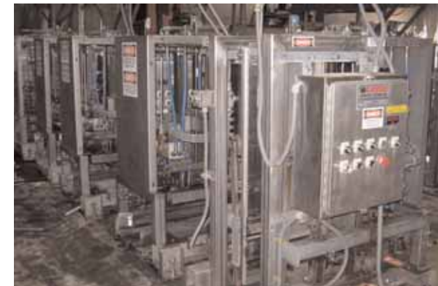
(7) Cannon Hydraulic Single ST83 Case Stackers