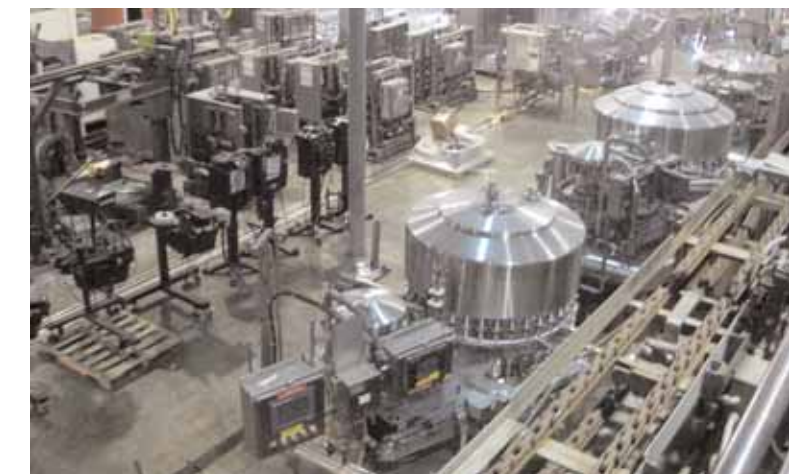
Overview of Federal Fillers, Labelers, Casers & Case Stackers