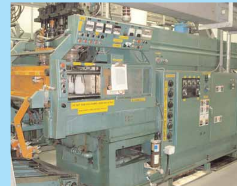
(5) Uniloy Blow Molding Lines (4-Wide System Pictured)

ONLINE BIDDING will be available through Bidspotter. See terms and details at www.harrydavis.com