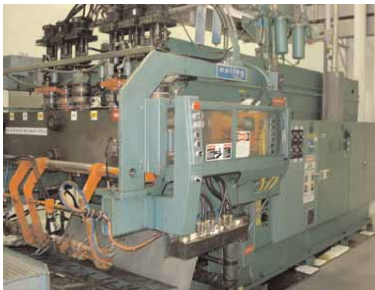
(3) Uniloy 6-Wide Blow Molders with Gallon Mold Sets