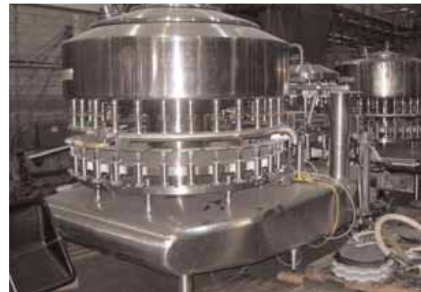
Federal 26-Valve Filler with 8-Head Capper