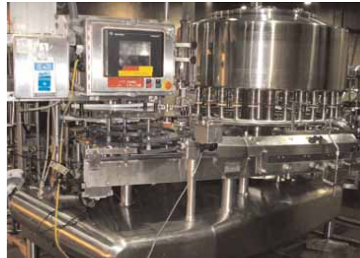
Federal 36-Valve PET Bottle Filler with 12-Head Capper and Federal 30-Valve Filler with 10-Head Capper

ONLINE BIDDING AVAILABLE AT www.harrydavis.com