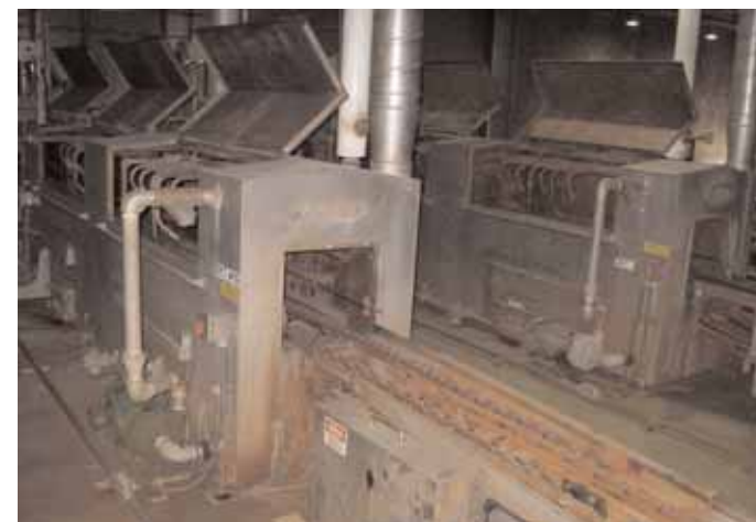
(3) Continental 24' S/S Case Washers

(2) Tetra SCU CIP Systems, Complete with Tri Clover 15 hp. Centrifugal Pump, Allen Bradley SLC 500 PLC Controller, & 1336 PLUS Variable Speed Controller, 40" S/S Shell & Tube Heat Exchanger, & (2) 34" H x 8" W S/S On-Line Filters.