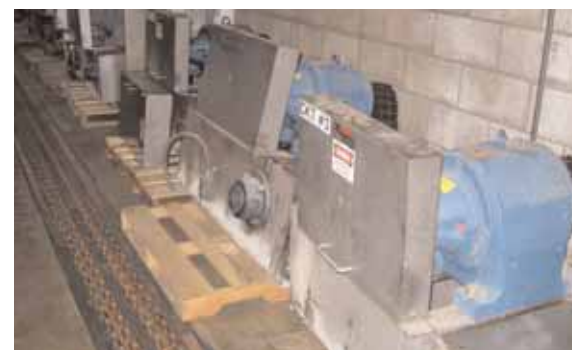
(30) Cannon 5, 7.5 and 10 hp Case Conveyor Drives

(4) Raymond Narrow Aisle Stock Pickers, Model 537-CSR30T, 3,000 lb. capacity, 240" height, S/N 537-97-02619, 537-95-01768, 537-95-01767 and 537-95-01768.