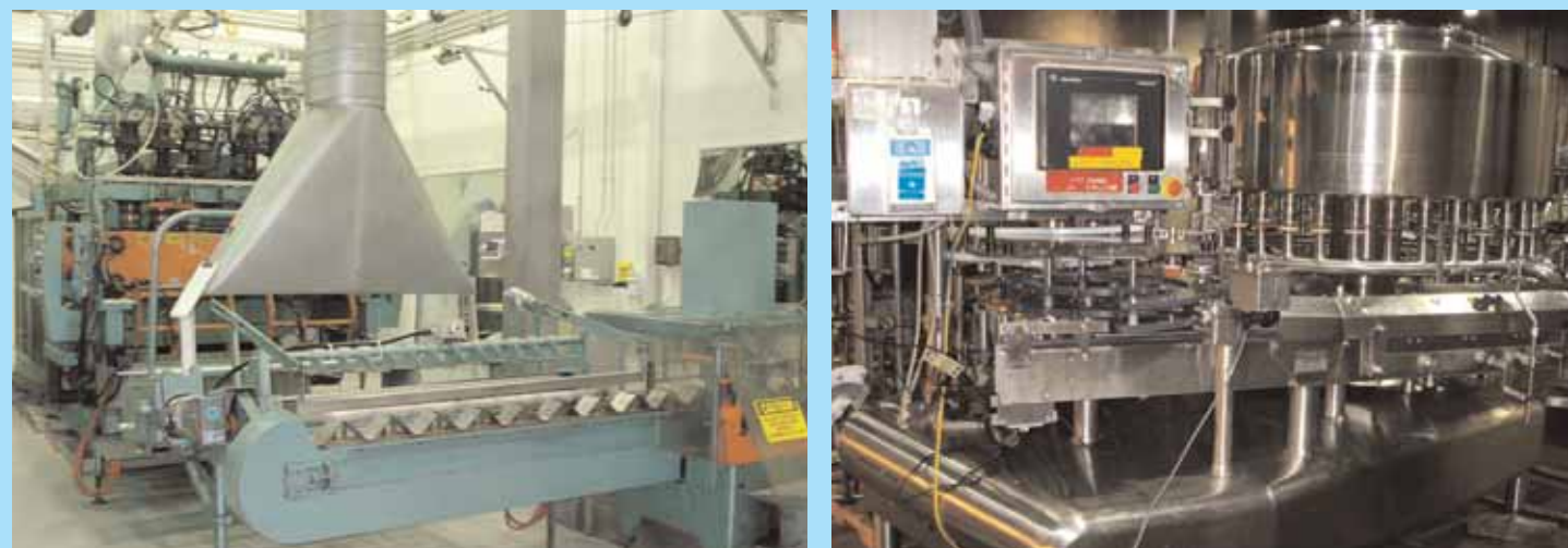
(5) UNILOY BLOW MOLDING LINES - (8) FEDERAL & TETRA FILLING LINES - CASE EQUIPMENT & MORE!

AUCTION: Thursday, April 10 at 10:00 a.m.