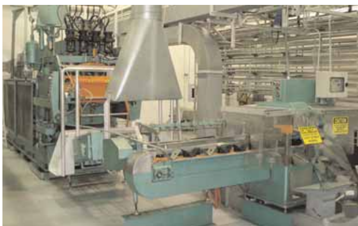
Uniloy 5-Wide Blow Molder with Half-Gallon Mold Set - Uniloy 4-Wide Blow Molder with Gallon Mold Set