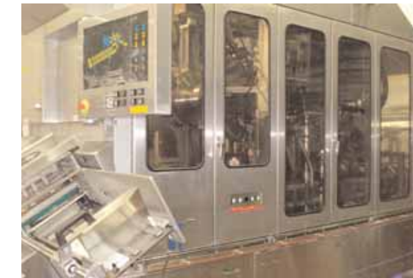
Tetra Pak Rex Model TR-6 Carton Filler with Fitment and Tetra Mini Half-Pint Carton Filler