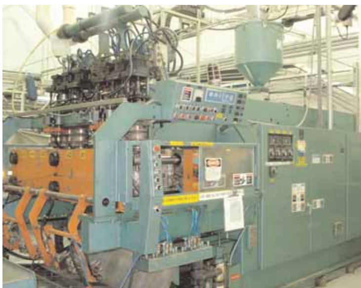
(3) Uniloy 6-Wide Blow Molders with Gallon Mold Sets