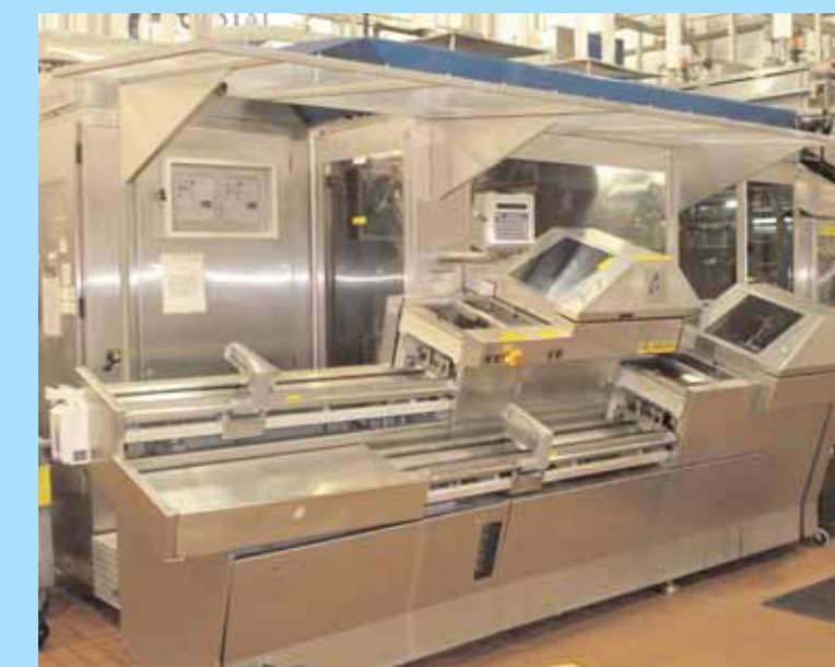
Tetra TR-8-ESL Filler with Automatic Carton Loader