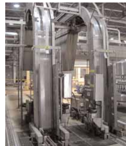
(3) Cannon S/S Case Destackers