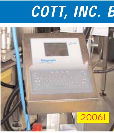
(3) 2006 Diagraph Inkjet Coders