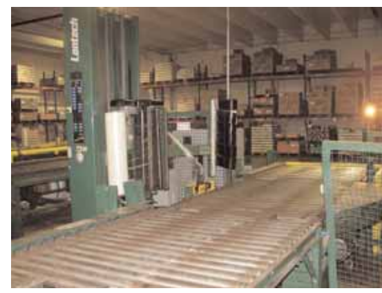
(3) Lantech Model SVAMD Stretch Wrapper