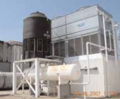
Evapco Condenser, Delta Cooling Tower, CO 2 Tank - (7) Vilter Ammonia Comp. to 150 hp