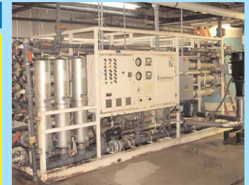
Osmonics 300 gpm Reverse Osmosis System

ONLINE BIDDING will be available through Bidspotter. See terms and details at www.harrydavis.com