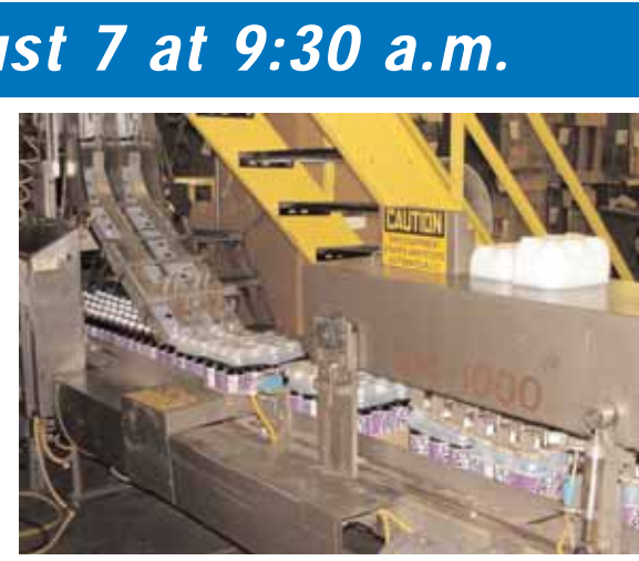
Contour Model 104-100 Packer