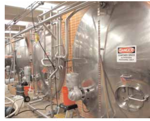
(12) S/S Tanks including (4) Mueller & C.B. 5,000 to 8,000 Gal. All S/S Sugar Tanks