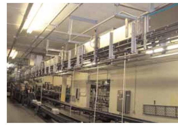
Sentry & Jetstream Air Conveyors NEW AS 2005!

(20) TANKS - including BLENDING TANKS (2) Mueller 5,000 gal. Horizontal Jacketed S/S Sugar Tank, S/N 61183, 81115-1 (2) Cherry Burrell 5,000 gal. Horizontal Jacketed S/S Sugar Tank, S/N 67-385-2, 67385-1, #S3, & S4 Caldwell aprox. 4,000 gal. Sugar Tank, Model 4997 YB 1963, #C (2) Cherry Burrell 1,300 gal. S/S Tanks, Cherry Burrell 1,100 S/S Tank & Others. Cherry Burrell 750 gal. S/S Tank, Model CV, S/N 750-77-2736 Cherry Burrell 400 gal. S/S Tank, Model CV, S/N 400-77-1730 (2) Crepac 8,000 gal. S/S Sugar Tank, S/N C2887, & 88 Liquid Sugar Support Items, Including Pumps, UV Systems, Piping, Etc.