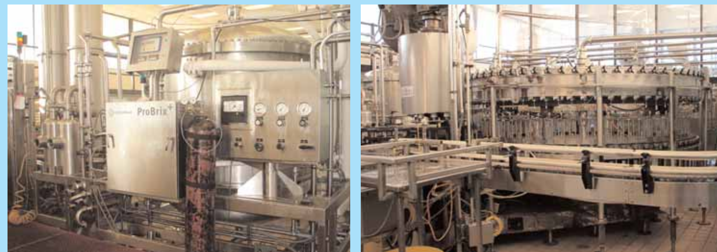
(3) MOJONNIER BLENDING SYSTEMS - HK 72-VALVE ROTARY FILLER - ADDITIONAL PACKAGING EQUIPMENT!

COTT, INC. BEVERAGES - Elizabethtown, KY Tuesday, August 7 at 9:30 a.m.