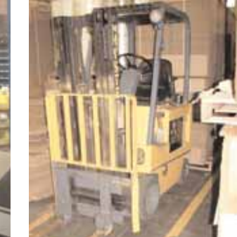
Forklifts & Material Handling

AMMONIA REFRIGERATION SYSTEMS (5) Vilter 150 hp. Ammonia Compressors, Model 448, S/N 48317, 48843, R-15645, 48842, R-11517 Vilter 75 hp. Ammonia Compressor, Model 446, S/N 48843 Vilter 60 hp. Ammonia Compressors, Model 444, S/N 22966 Other Ammonia System Components, Including Receiver, Valves, Piping, More.