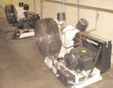
(4) I.R. Air Compressors to 100 hp