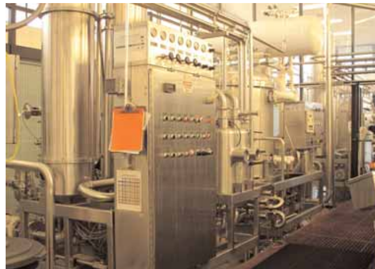
(1) of (3) Mojonnier/RDM Blending Systems / Carbo Coolers