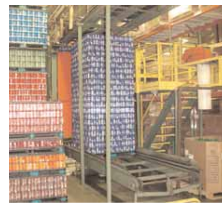
Seco Hi-Level Depalletizer