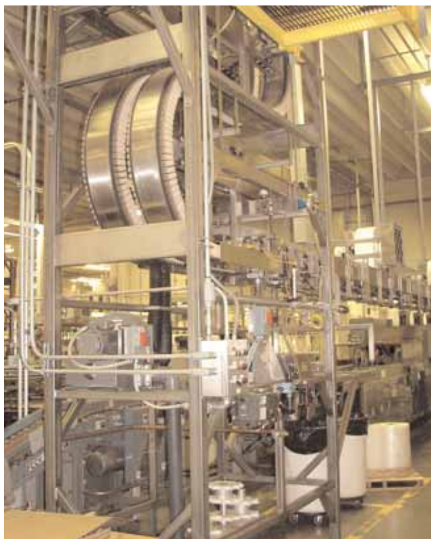
2005 Sentry Lowerator / Rinser