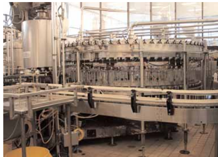
HK 72-Valve Rotary Filler & Fowler/Zalkin Capper

COTT, INC. - Elizabethtown, KY Tuesday, August 7, 2007 at 9:30 a.m.