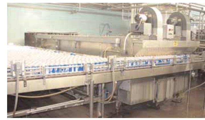
Warming Tunnel & Accumulation Table