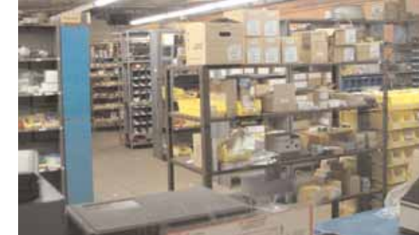
Extensive Spare Parts Inventory - VISIT WEBSITE!!