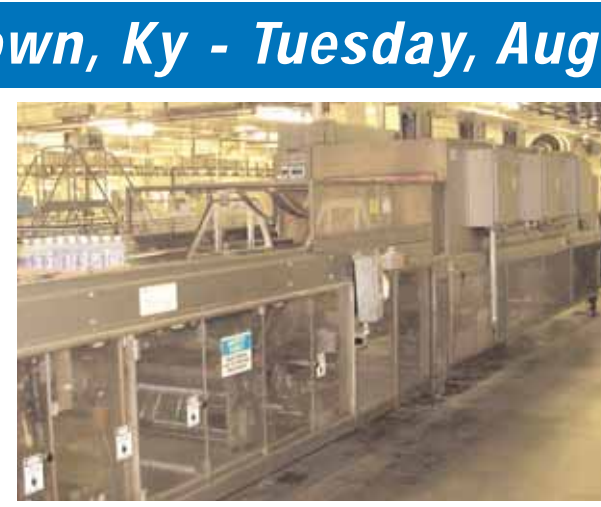
Arpac Model BT-TW-60 Shrink Wrapper & Tunnel