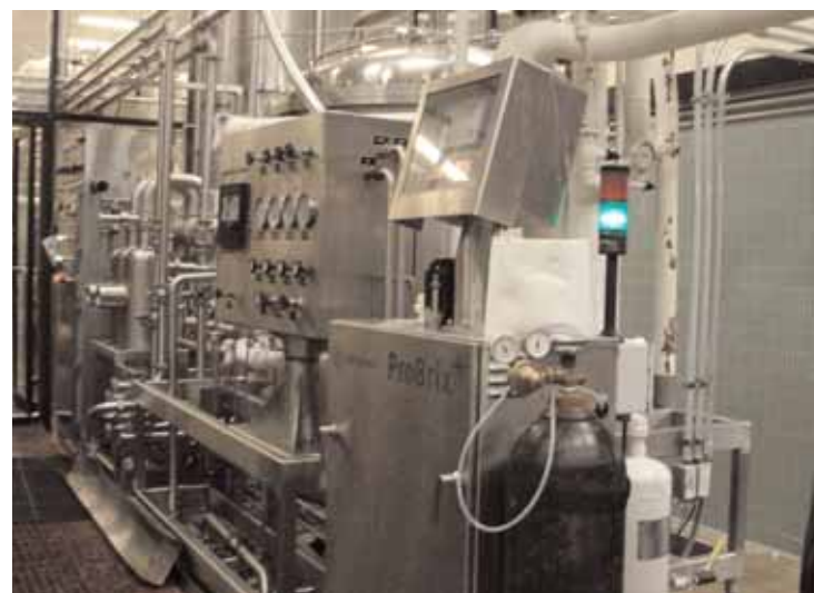
(1) of (3) Mojonnier/RDM Blending Systems / Carbo Coolers