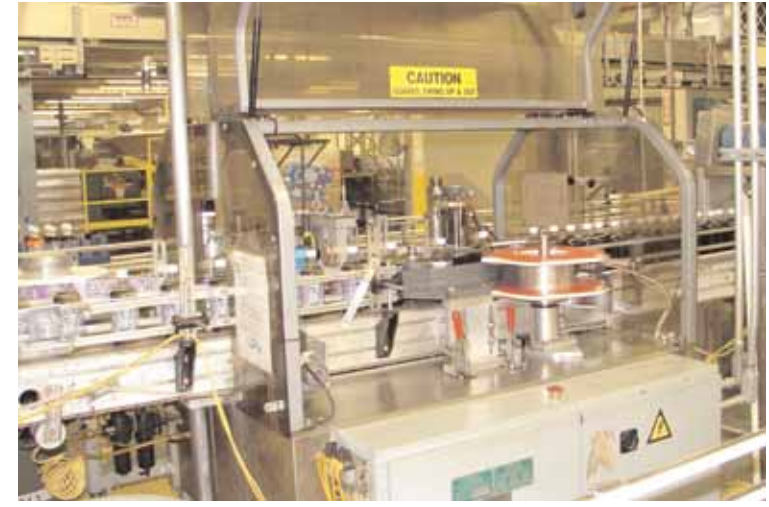
(3) Trine Model 5500 & 4500 Rotary Labelers

CIP SYSTEM Skid Mounted Single Tank CIP System, w/Pump & Controls.