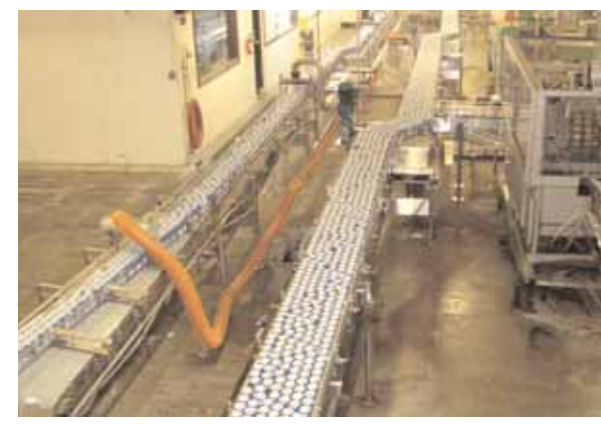
Can & Bottle Conveyor Systems