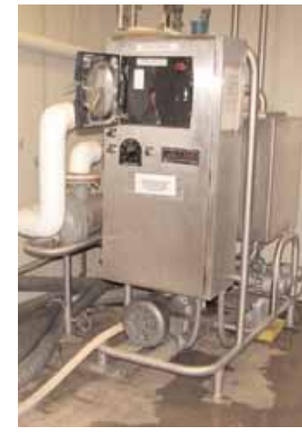
Skid Mounted CIP System

AIR DRYERS Ingersol Rand Air Dryer, Model TM600E4, S/N 97GTM286 Ingersol Rand Air Dryer, Model DS50, S/N 280578009 (2) Ingersol Rand Air Filtration Unit, Model NLM-2, IRGP64, S/N 42515825