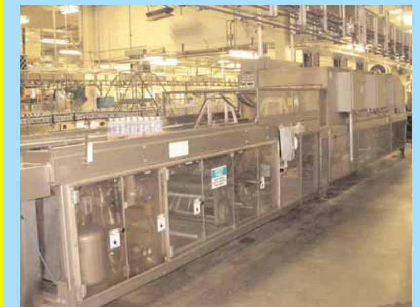
Arpac Shrink Wrapper & Tunnel