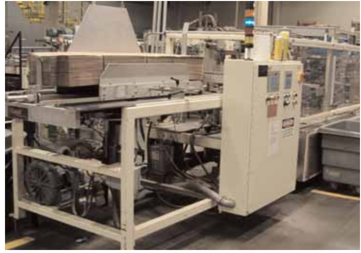
Kayat PTF-28 & PTF-30 Tray Packers