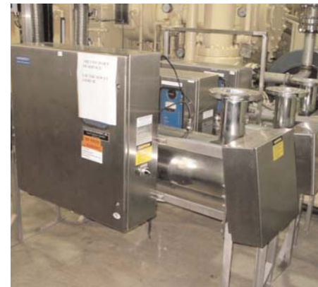
(2) Ideal Horizons S/S UV Systems