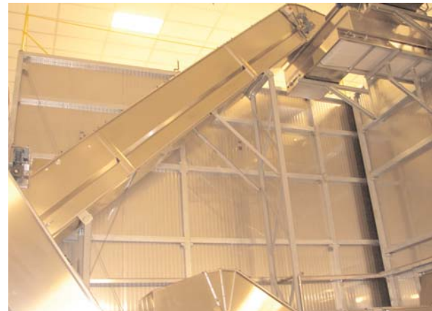
(5) Complete Lanfranchi Bottle Storage Systems