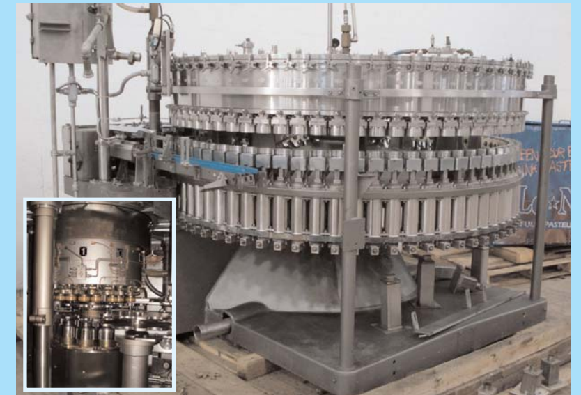
Meyer 72-Valve Rotary Filler and Sasib 10-Head Seamer (Inset)