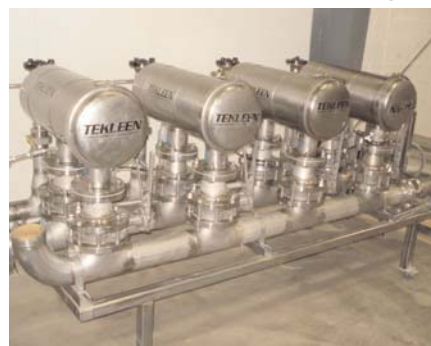
Tekleen and Millipore S/S Filtration Systems