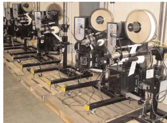
(7) Little David Labelers