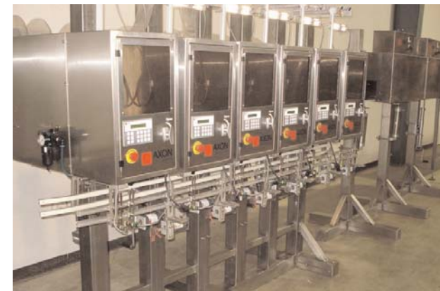
Axon 6-Station Shrink Labeler