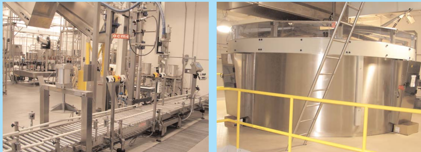
2003 OCME Bulk Drum Filling Line - (3) 2004 & 2003 Lanfranchi All S/S Bottle Orienters

formerly of LENATURE'S - Latrobe, PA Thursday, February 28 at 9:30 a.m.