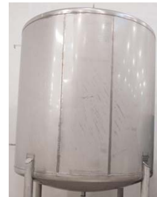
2,000 Gal. S/S Blending Tank