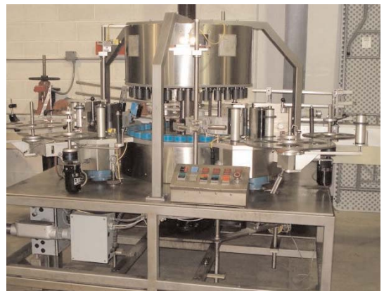
Shorewood 28-Station Rotary Labeler