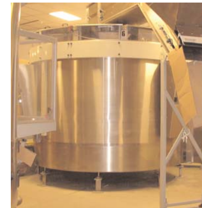
(3) Lanfranchi S/S Bottle Orienters