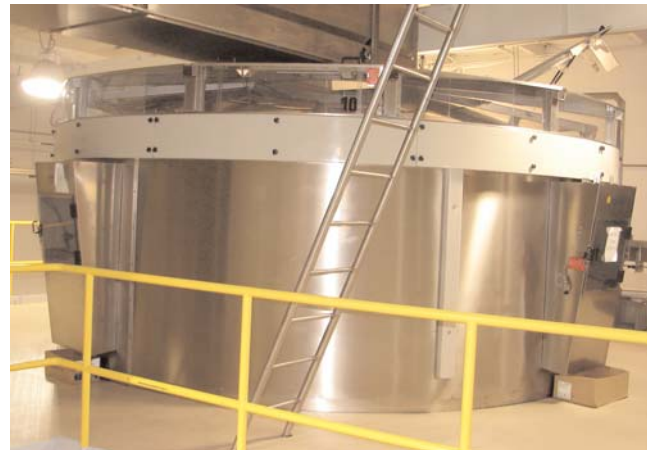
(3) 2004 & 2003 Lanfranchi S/S Bottle Orienters