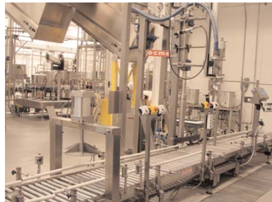
2003 OCME Bulk Drum Filling Line