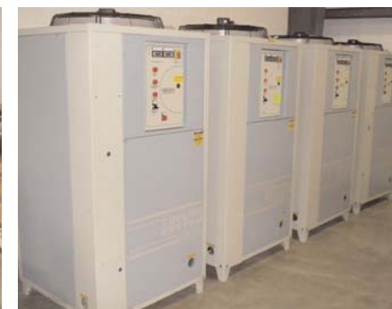
(4) Euro Cold 2-Ton Chillers